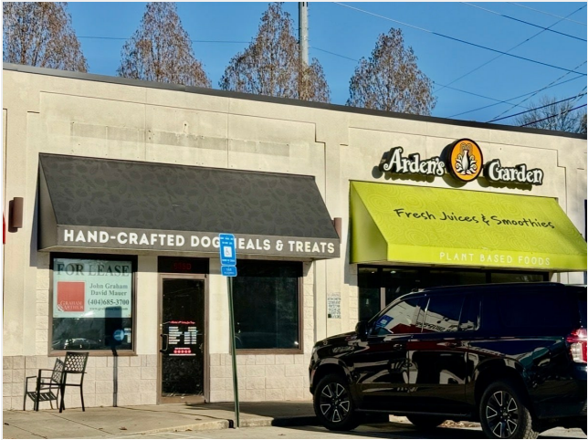
Suite D Front Entrance