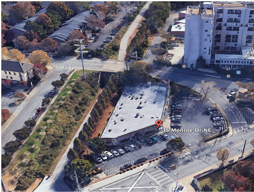
At the Intersection of Monroe Drive, 10th Street, Highland Avenue, & the Beltline Eastside Trail