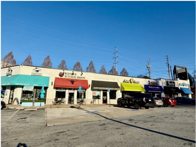
Front Entrance & parking lot