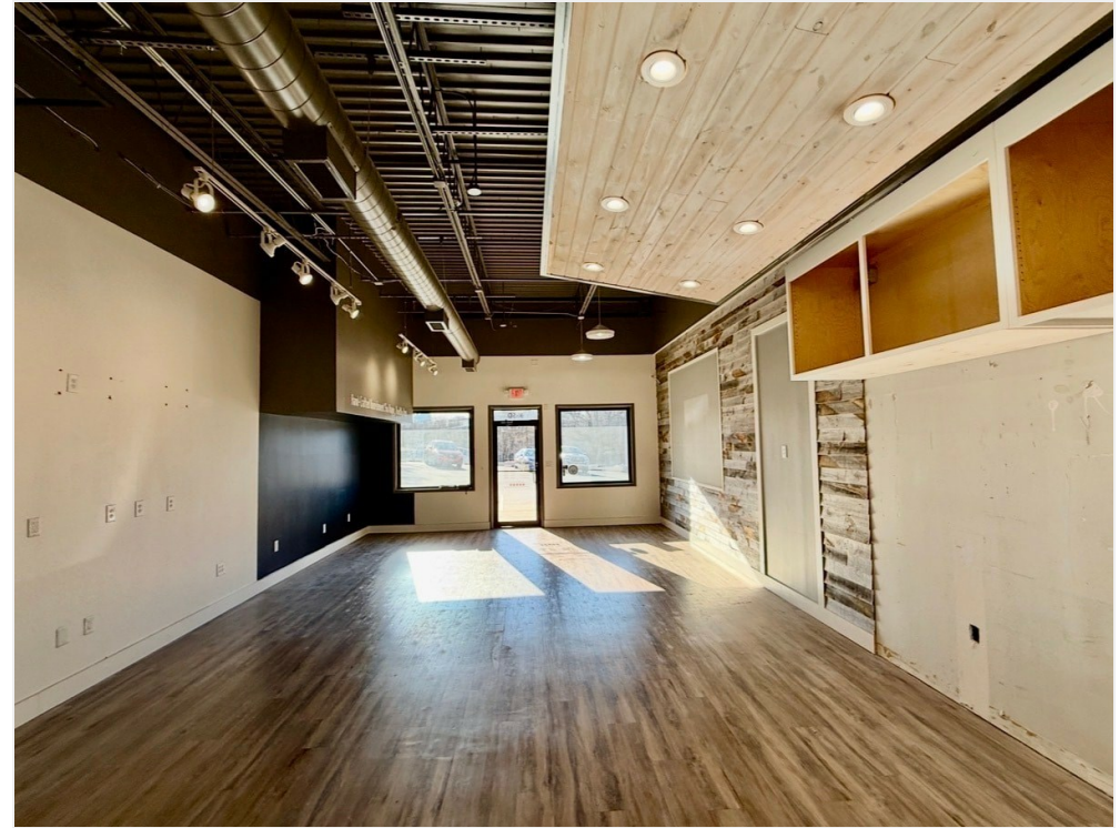
Suite D Interior Photo