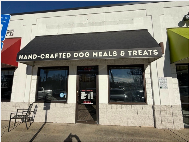
Suite D Front Entrance