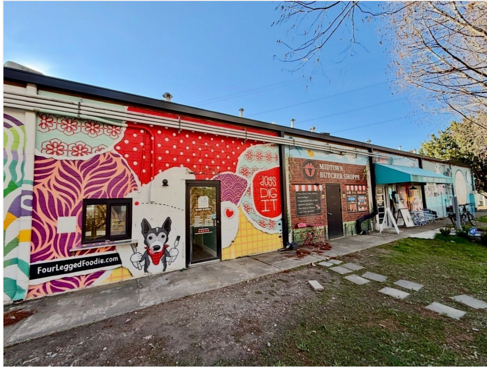
Suite D Rear Beltline Entrance