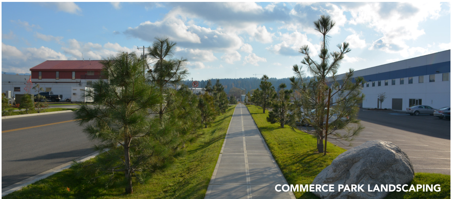
COMMERCE PARK LANDSCAPING