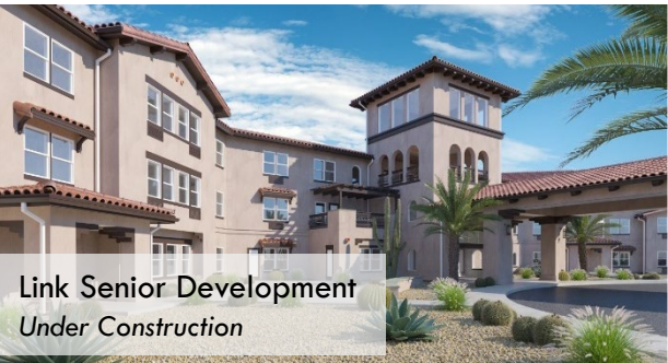
Link Senior Development Under Construction