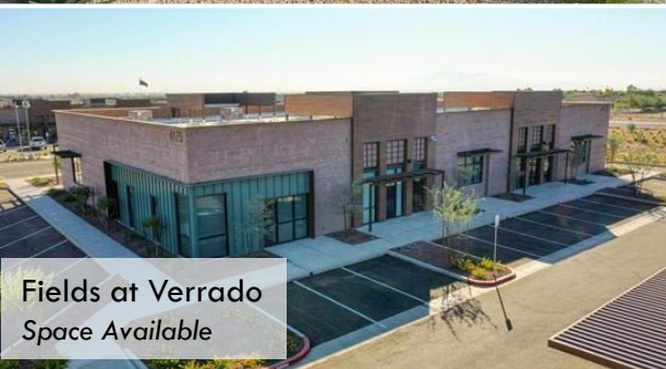
Fields at Verrado Space Available