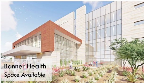
Banner Health Space Available

Since the onset of our Healthcare Market Study Initiative, we've helped bring two acute care hospital campuses and multiple medical office buildings to support our city's rapid growth. We didn't just sell a location — we shared the story of Buckeye's booming population and rising demand for care. That message resonated, resulting in a wide range of services coming to the city, from primary care and pediatrics to imaging, behavioral health, assisted living, and more.