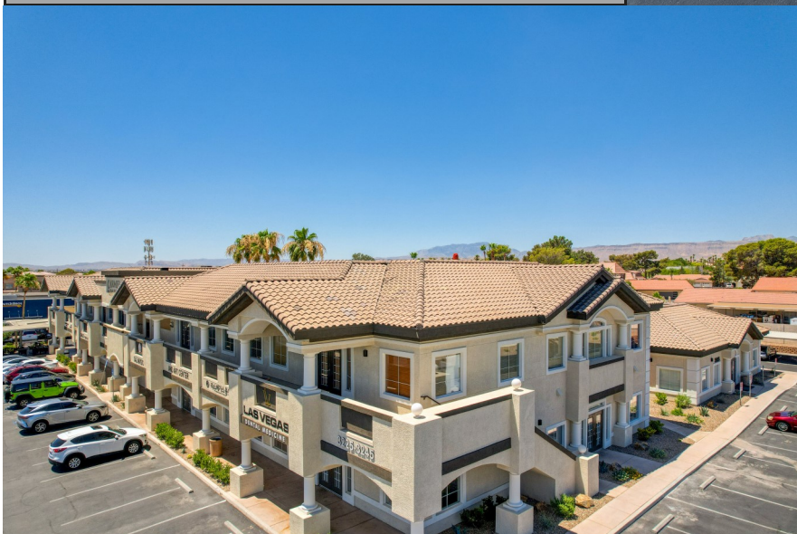
Image Style Quality Architecture Finishes Executive HQ Front-Center