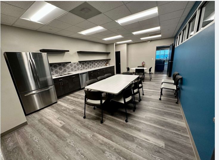
©2024 Bradley Company, LLC and affiliates. Use of any third party name or mark is for informational purposes only and does not indicate sponsorship or endorsement by such party. Not all information has been independently verified, and the presenting broker makes no guarantee about its accuracy. Any projections, opinions, or estimates are for example only. Before completing a real estate transaction, you and your advisors should conduct an independent investigation of the property to determine its suitability for your needs.