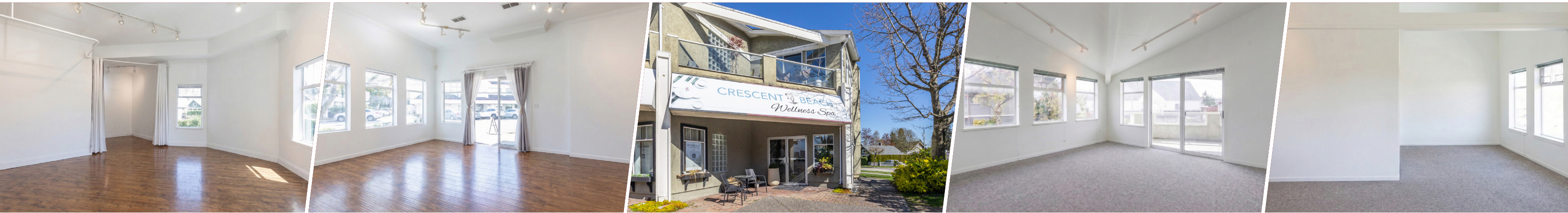
*Photos have been digitally altered to remove furniture and other chattels.