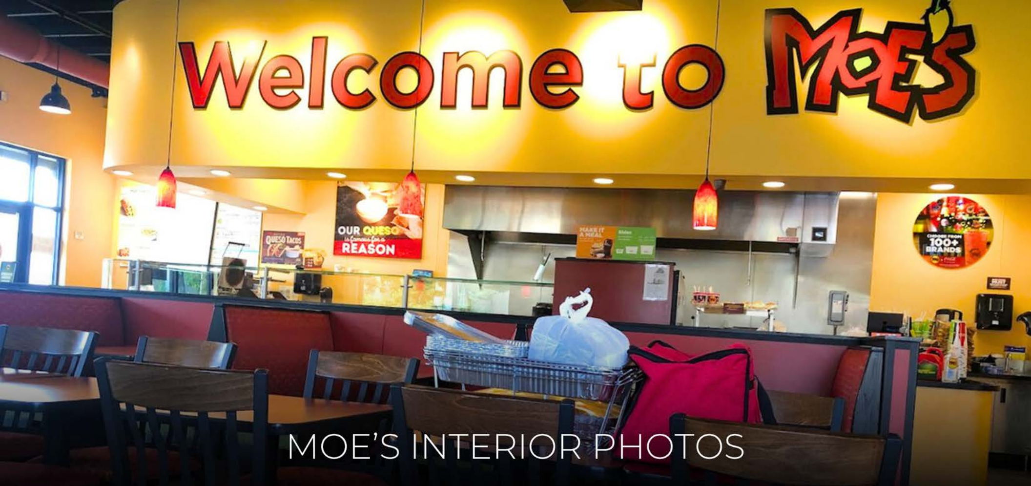
MOE'S INTERIOR PHOTOS