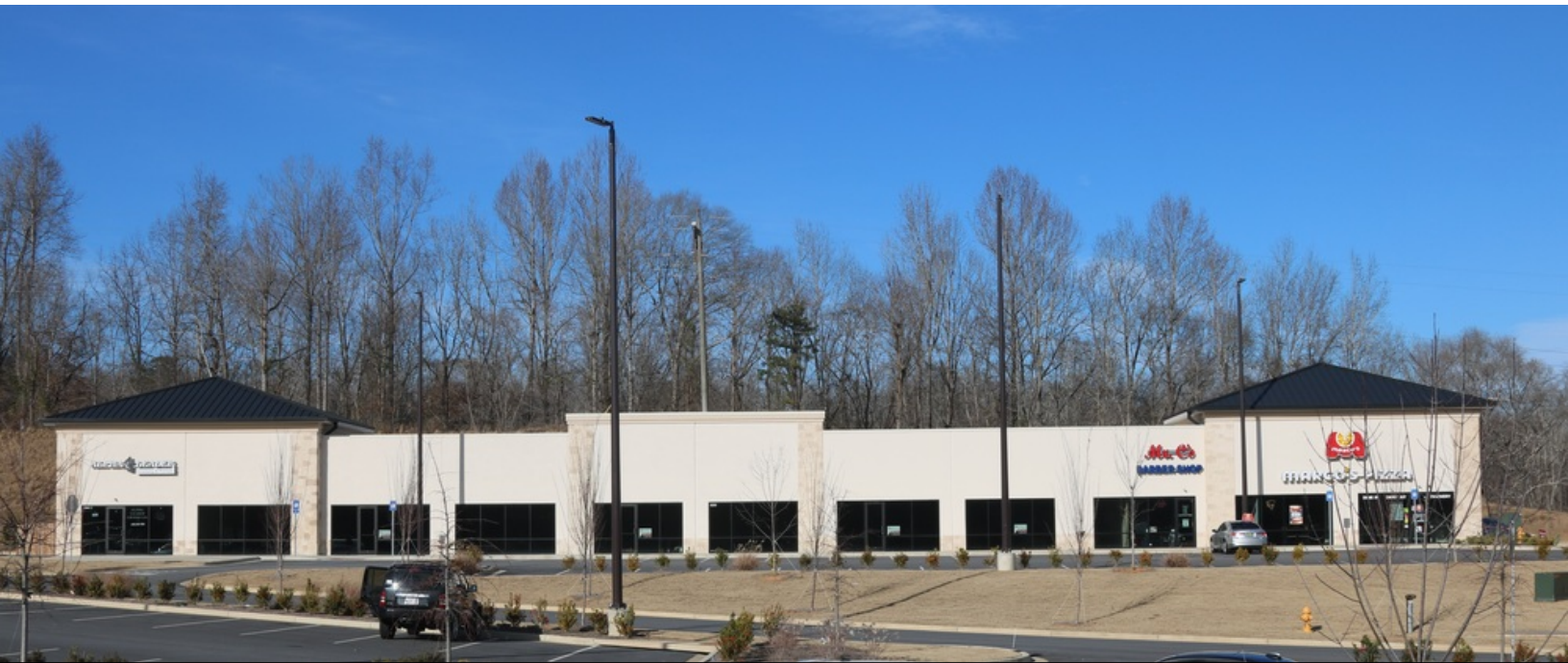
Full Retail Space