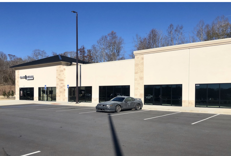
Crosswinds Lease Spaces