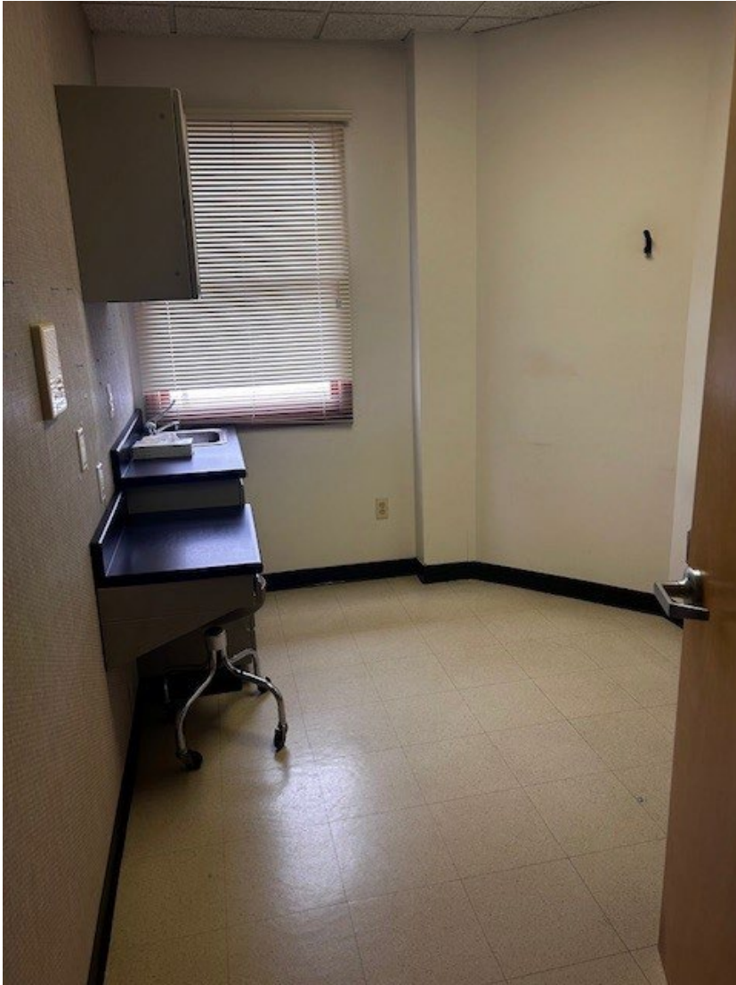
Exam Room 1