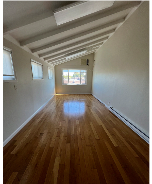
264 N. Santa Cruz Avenue