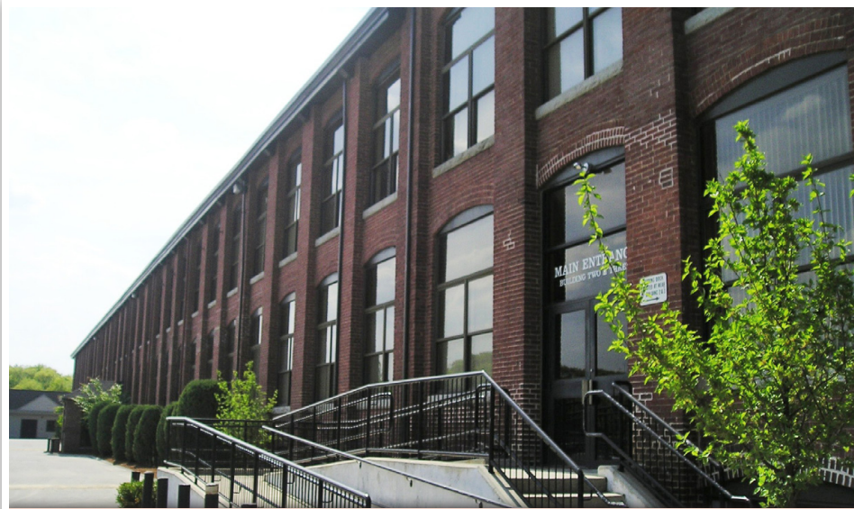
Floor plans and additional photos available online.