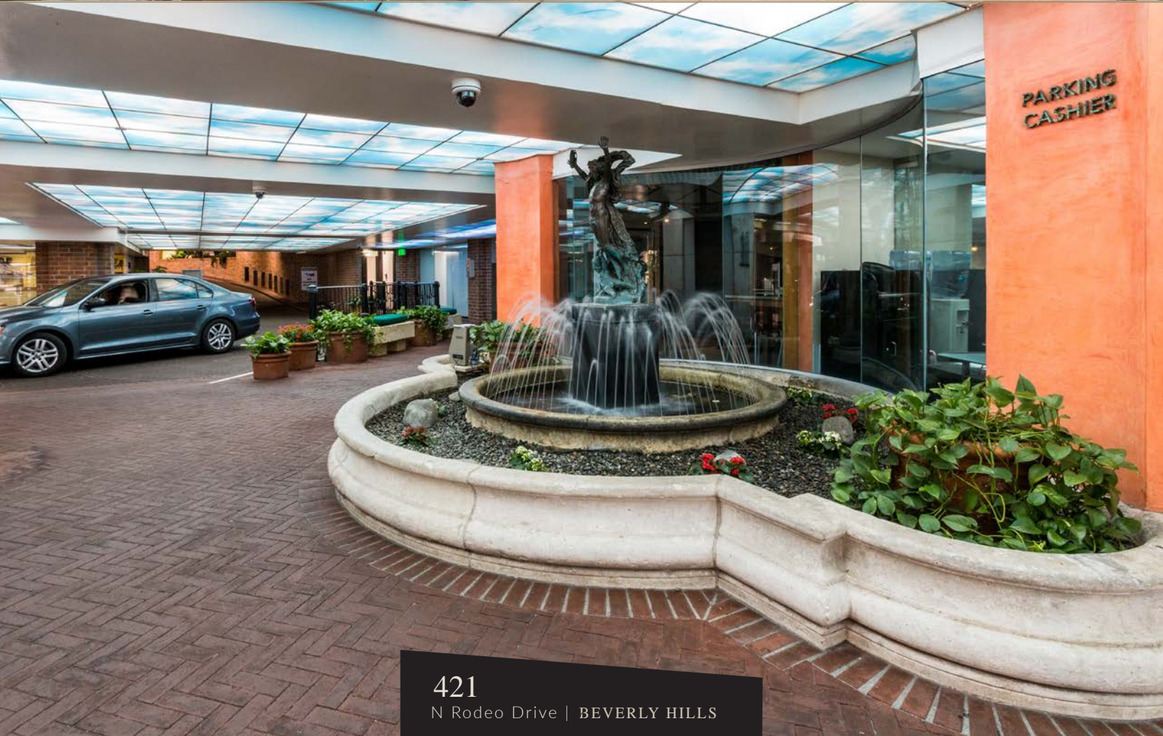
421 N Rodeo Drive | BEVERLY HILLS