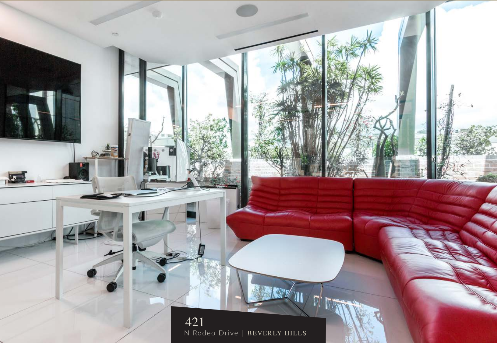
421 N Rodeo Drive | BEVERLY HILLS