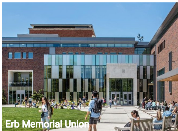
Erb Memorial Union