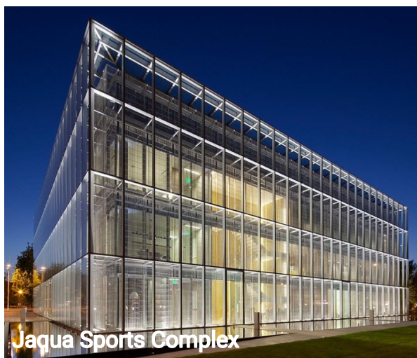
Jaqua Sports Complex