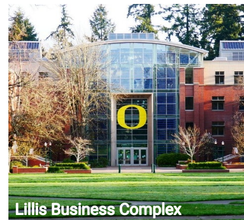
Lillis Business Complex