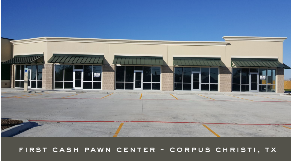
FIRST CASH PAWN CENTER - CORPUS CHRISTI, TX

2821 AIRLINE ROAD CORPUS CHRISTI, TX 78413