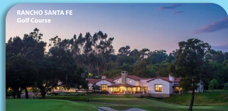
RANCHO SANTA FE Golf Course

Rancho Santa Fe is one of the most EXCLUSIVE AND DESIRED Communities in California.