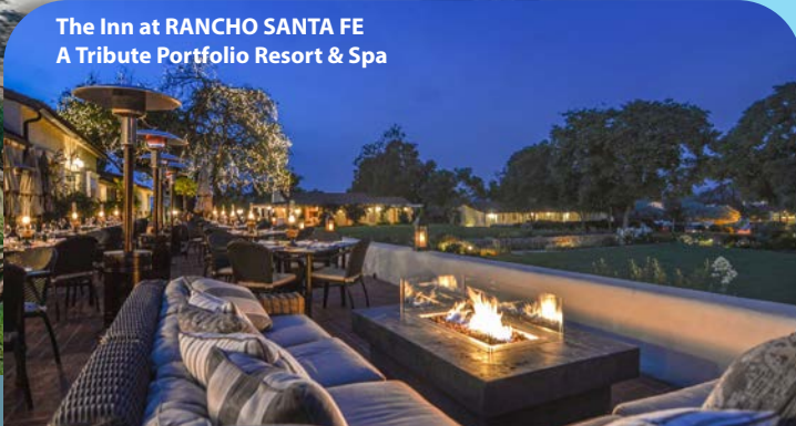
The Inn at RANCHO SANTA FE A Tribute Portfolio Resort & Spa