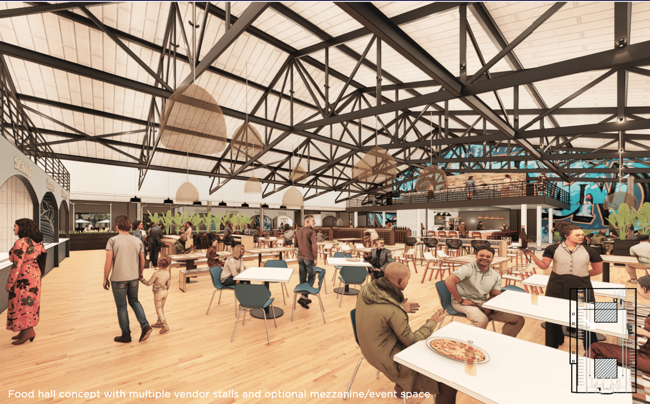
Food hall concept with multiple vendor stalls and optional mezzanine/event space