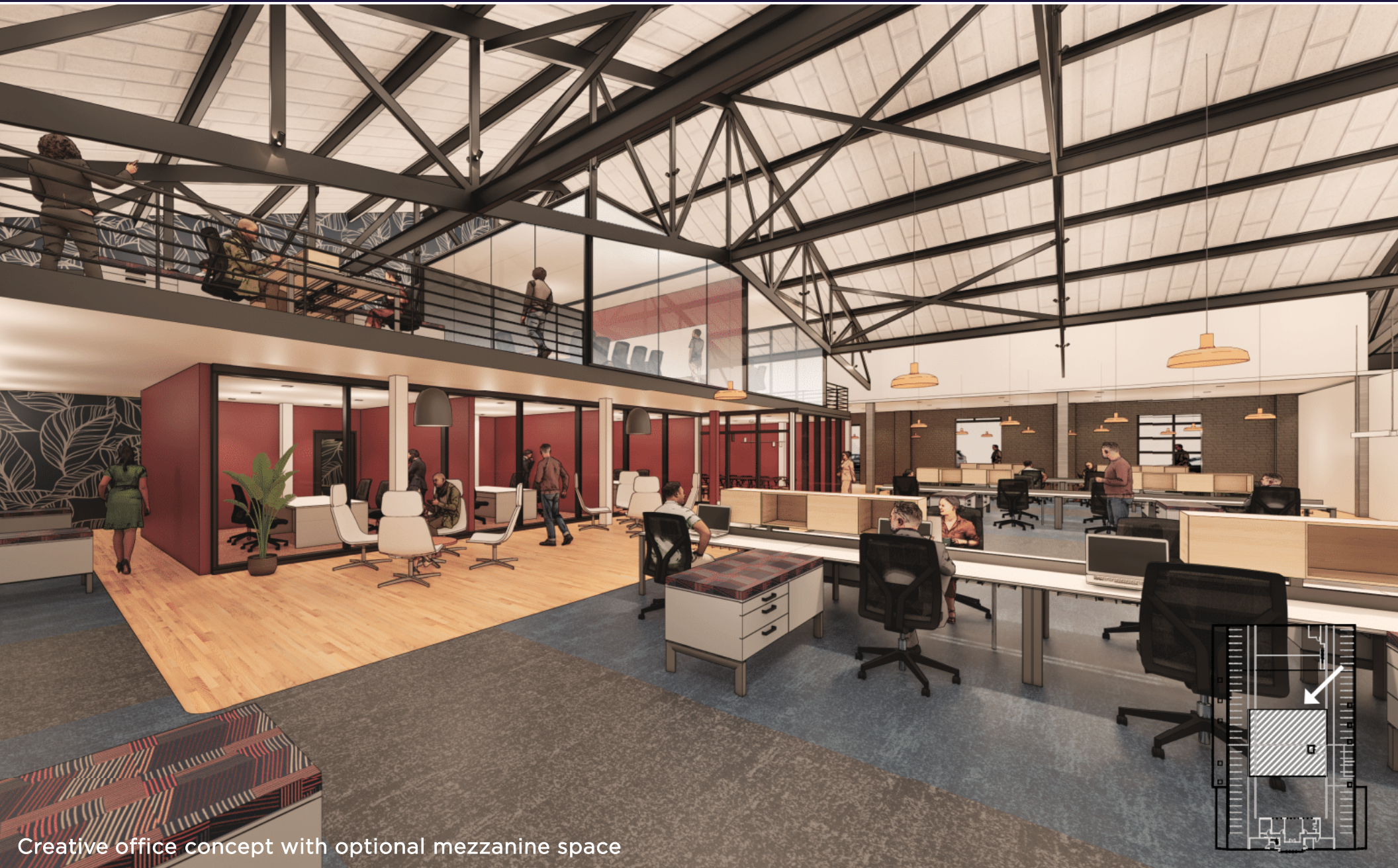
Creative office concept with optional mezzanine space