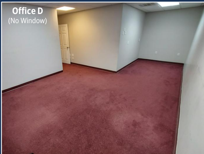
Office D (No Window)