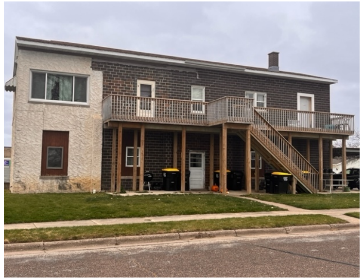
124 E Lincoln St