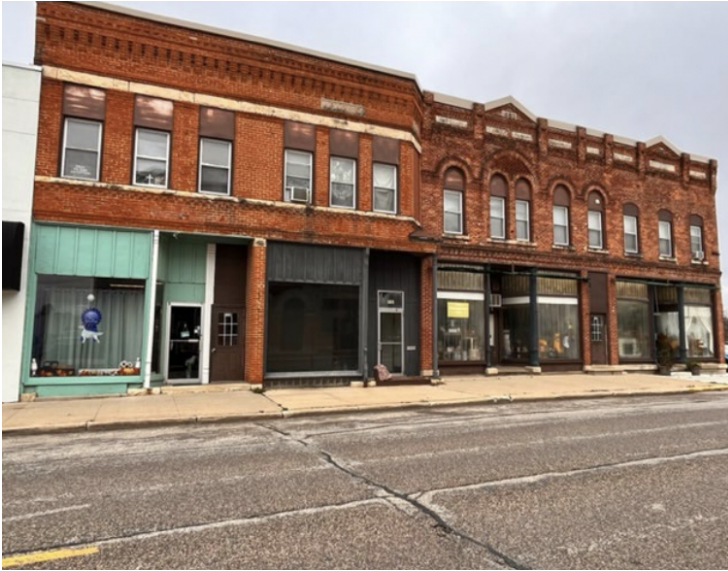
102 - 120 Kingston St