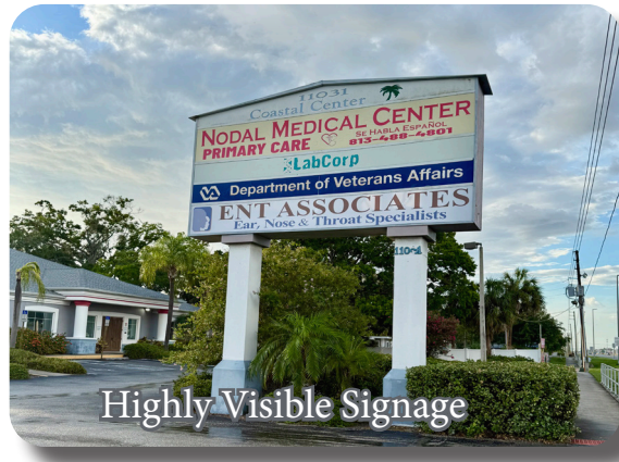
Highly Visible Signage