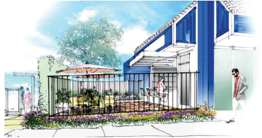
Conceptual Sketch (Shopfront and Outdoor Patio)