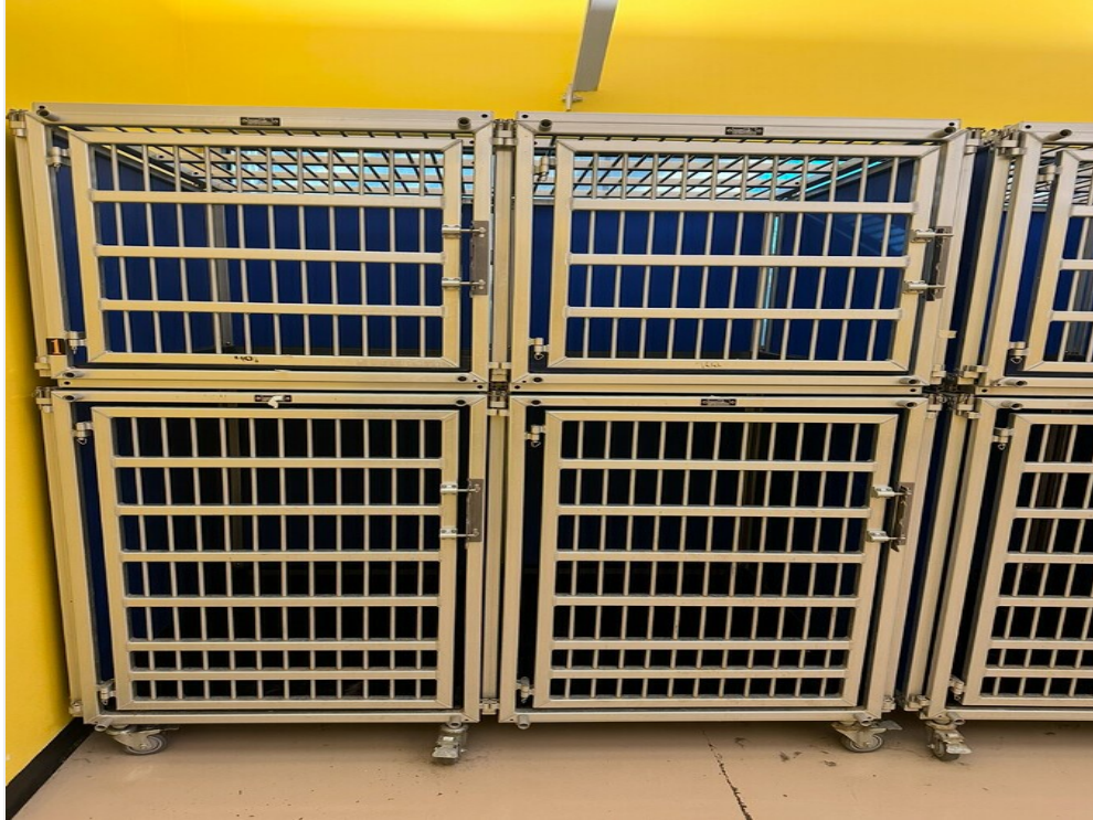
Large Dog Room