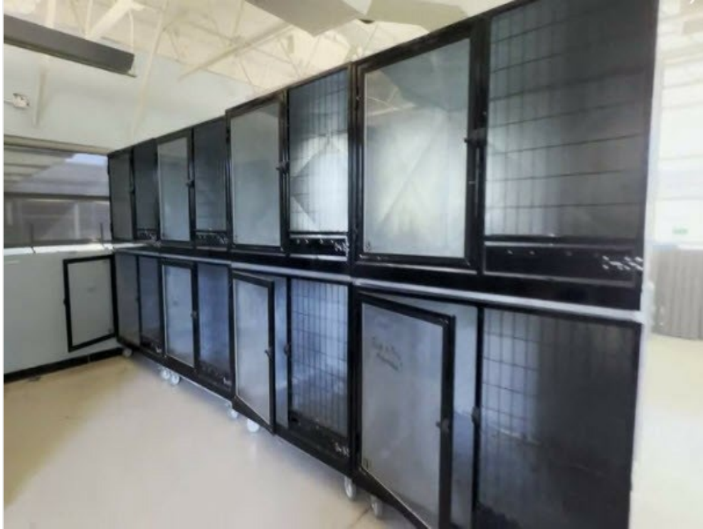
Small Dog Kennels