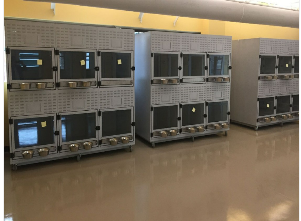
Medium Dog Room