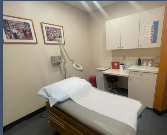
7 Exam Rooms