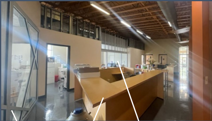
Nurses Station, Managers Office & Breakroom