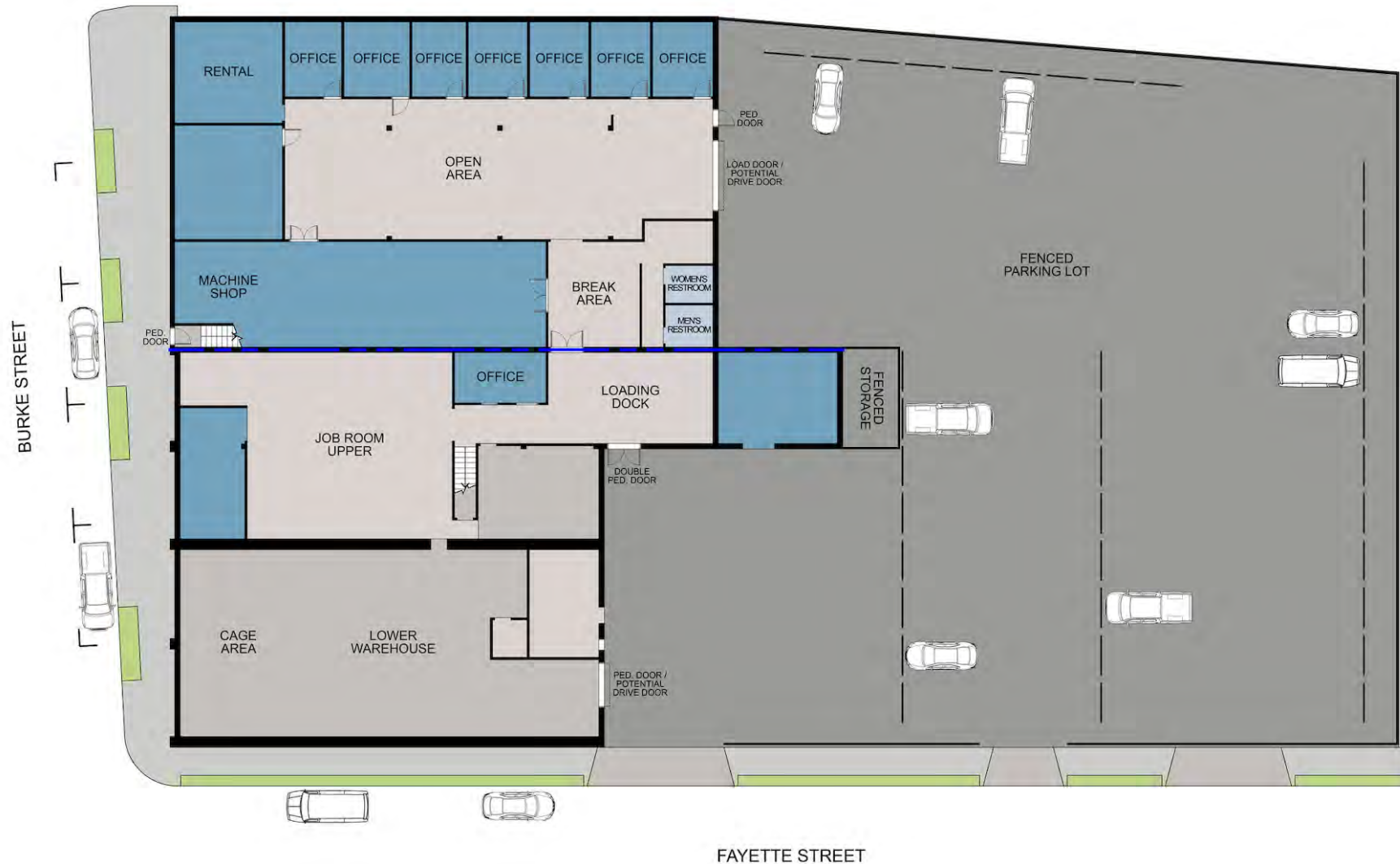
Lower-Level Floor Plan with Parking