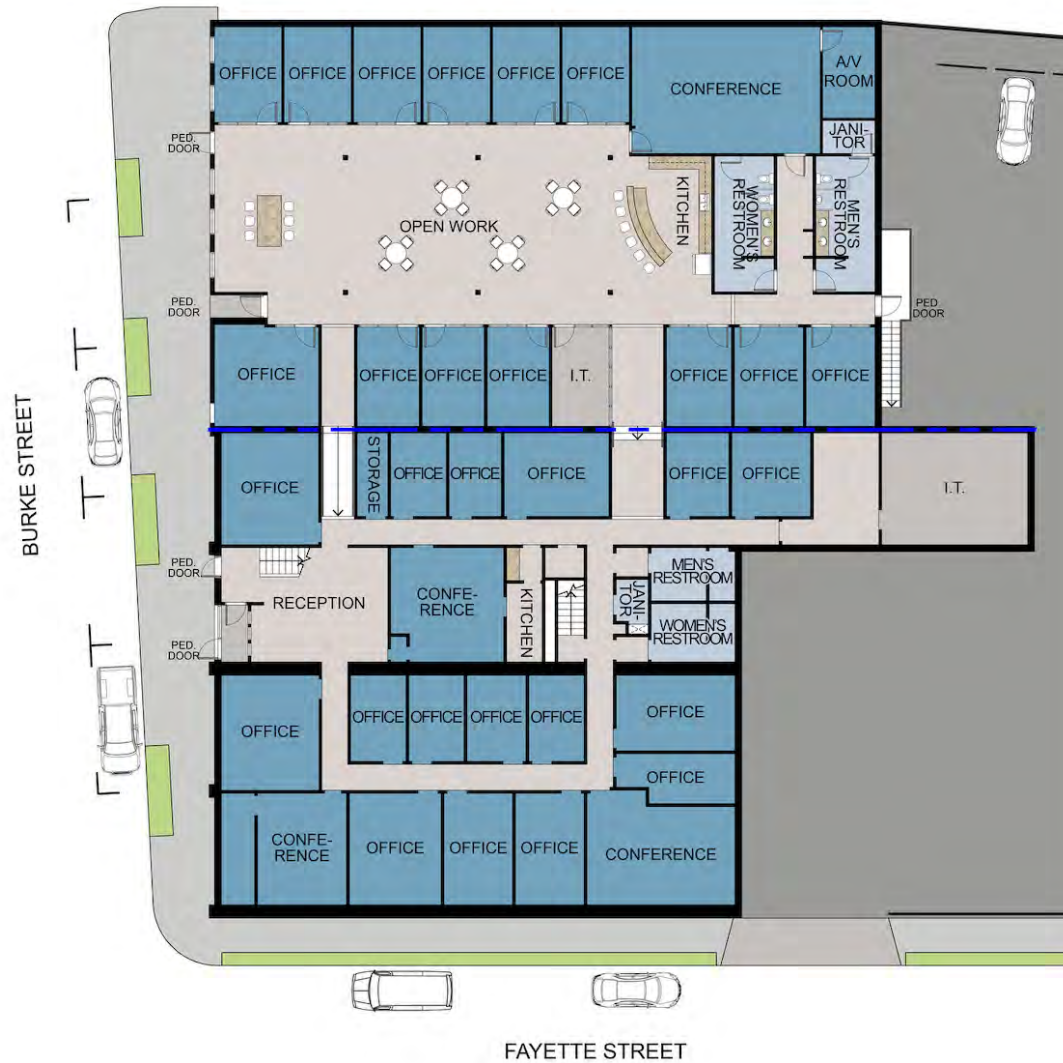
First-Level Floor Plan