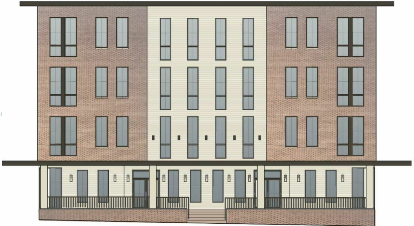
313 BUILDING EXTERIOR CONCEPT