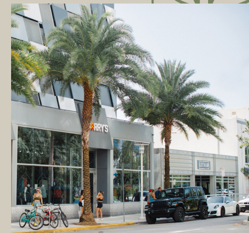
SUNSET HARBOUR Miami, FL