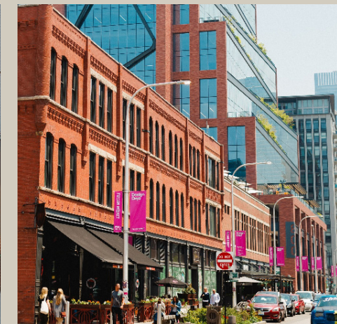
FULTON MARKET Chicago, IL