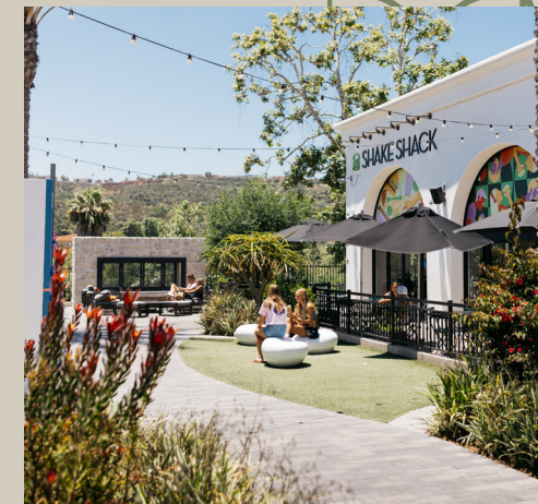
CARLSBAD San Diego, CA