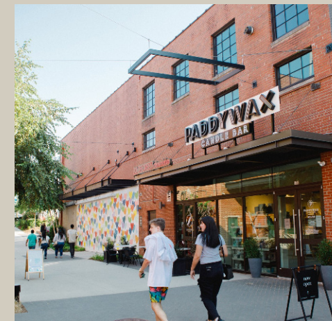
SOUTH END Charlotte, NC