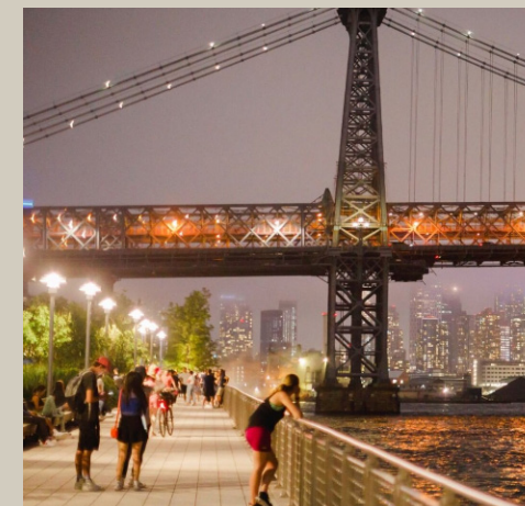
WILLIAMSBURG New York City, NY