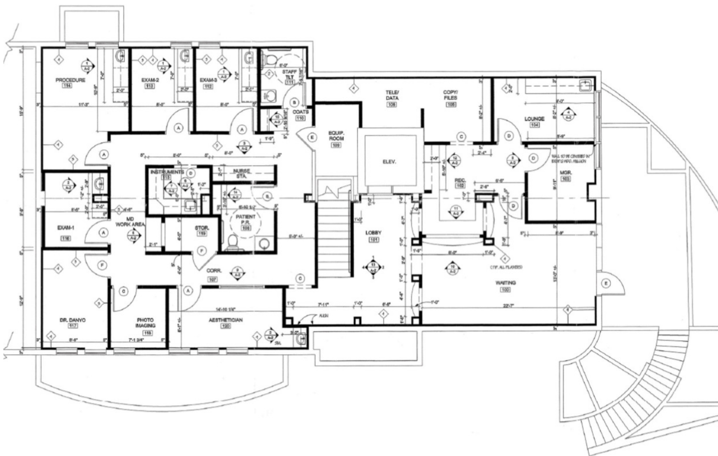
Suite 400A Floor Plan

OFFICE | 3701 KENNETT PIKE | GREENVILLE, DE 19807