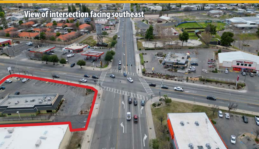
View of intersection facing southeast