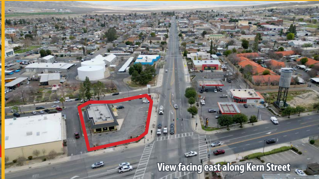
View facing east along Kern Street