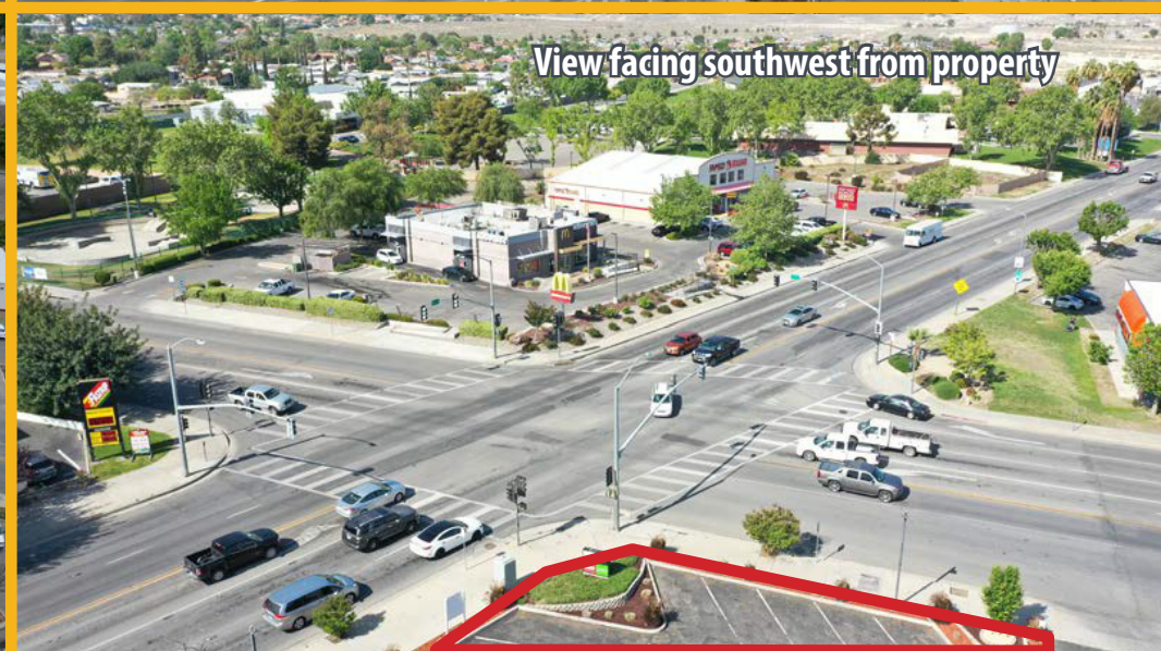
View facing southwest from property