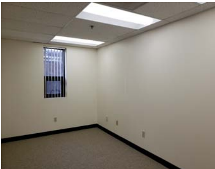
Office 4 With Window