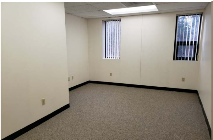
Office 2 With Windows