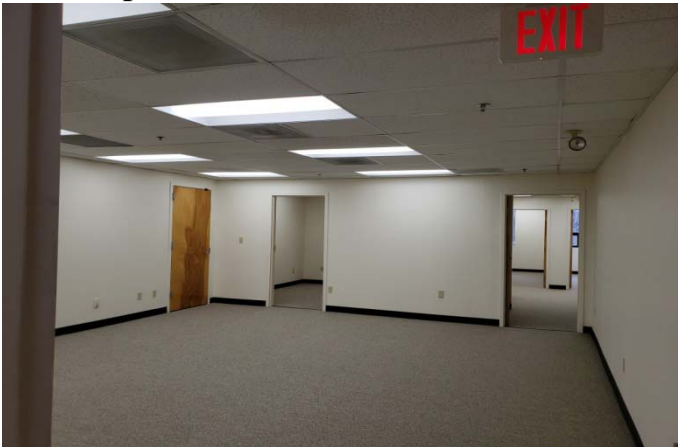
Open Office Area