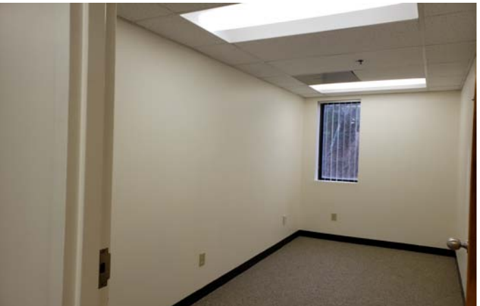
Office 3 With Window