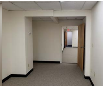
Interior Halls Break Area