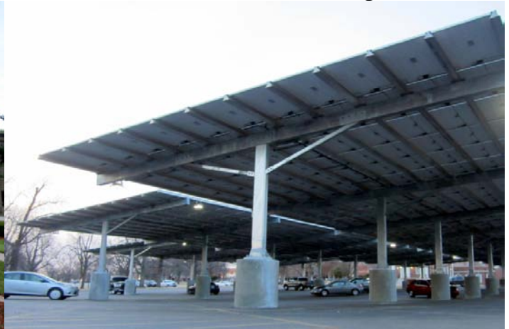
Solar Panel Covered Parking