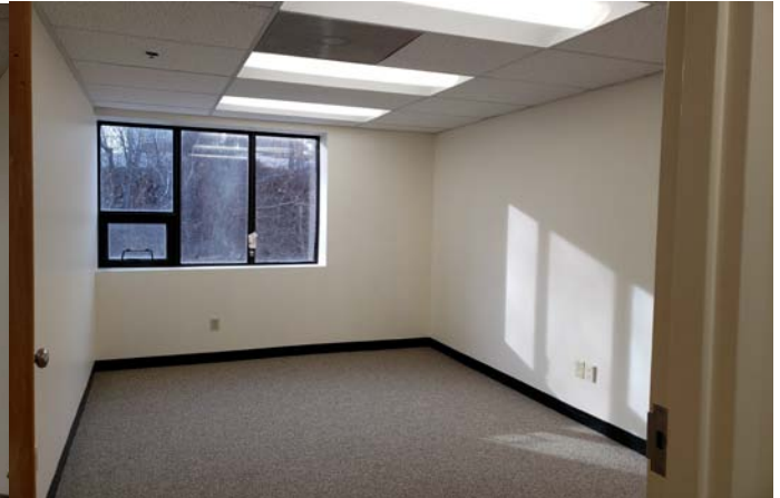
Office1 With Windows