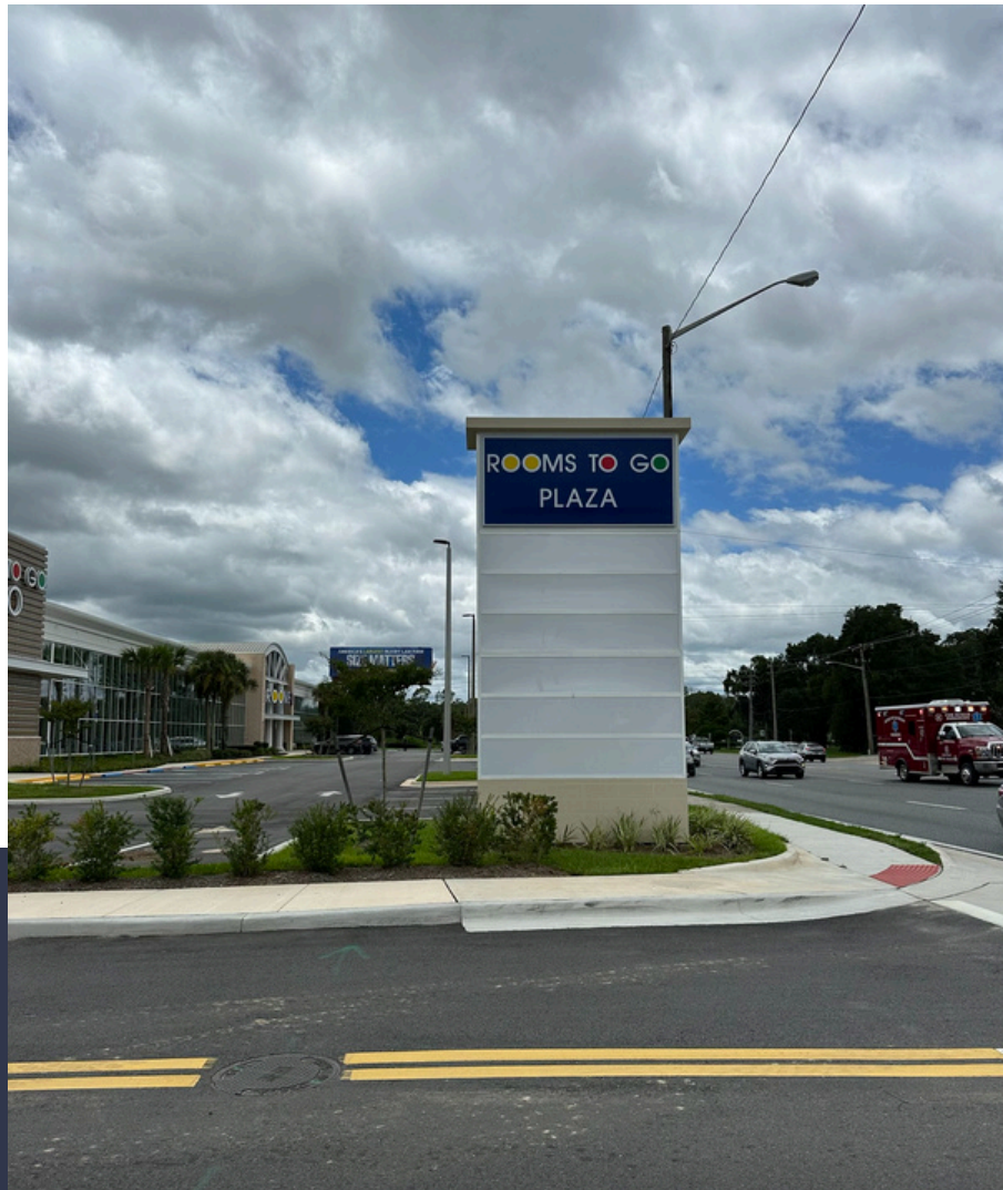
SW College Rd