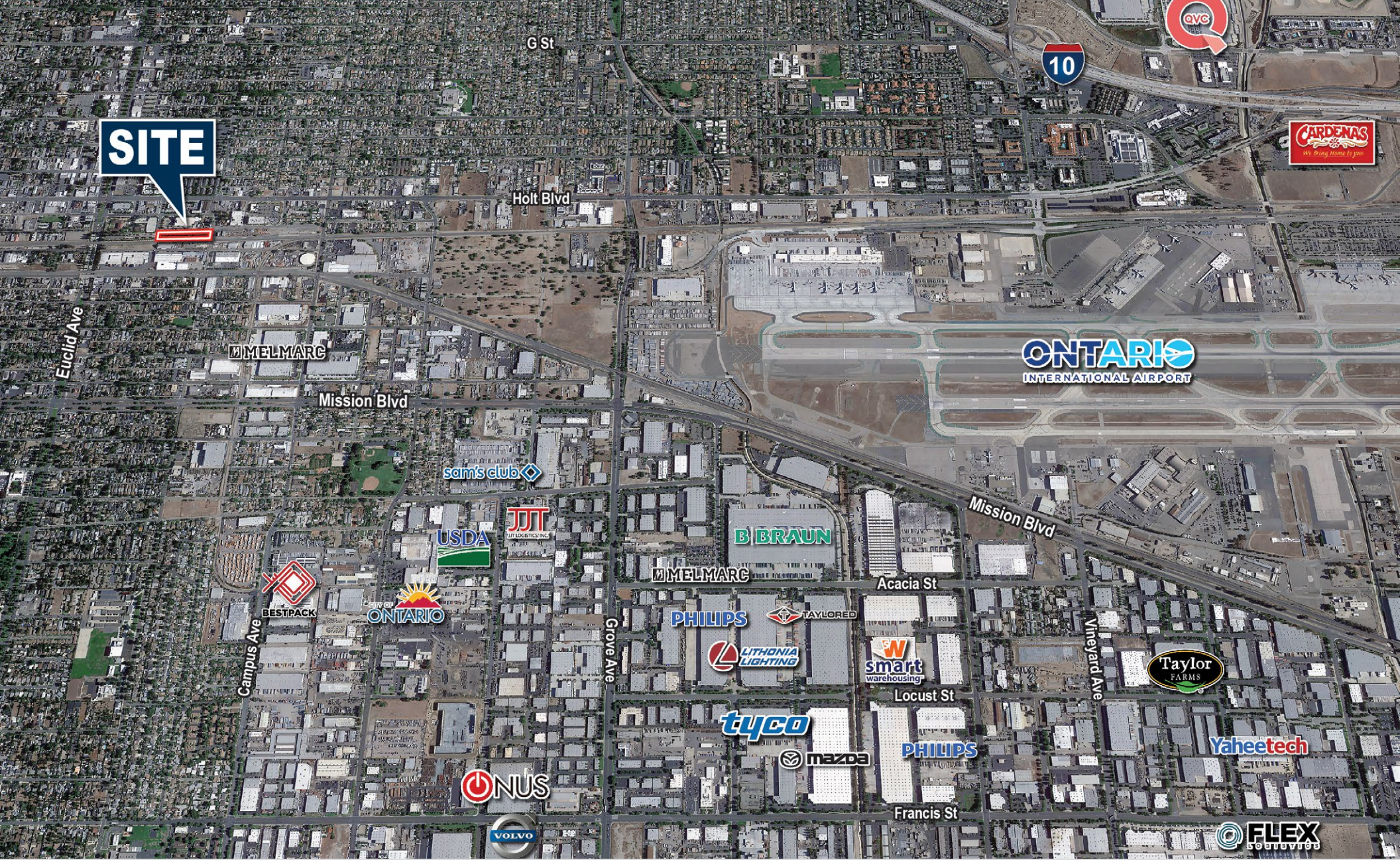
TENANT AERIAL : 3