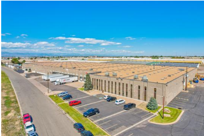
13331-13333 East 37th Ave. Denver, Colorado 80239