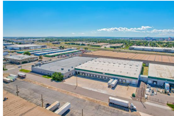
13100-13300 East 38th Ave, Denver, Colorado 80239