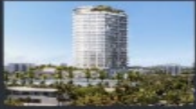
72 Park (206 condos)