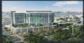
72 Collins Condominium (231 units)