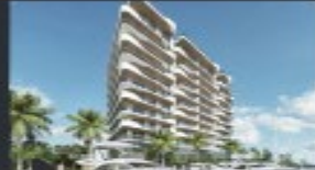
Monaco Yacht Club and Residence (39 Units)