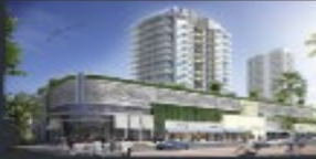
Sandor (110-key hotel and 58 luxury condos)