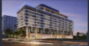
Ella Miami Beach (95 condos)