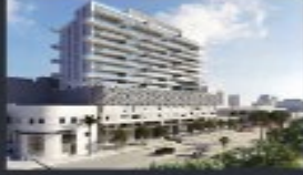
Aria Mehrabi (12-Story Tower)