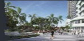
Ocean Terrace Park