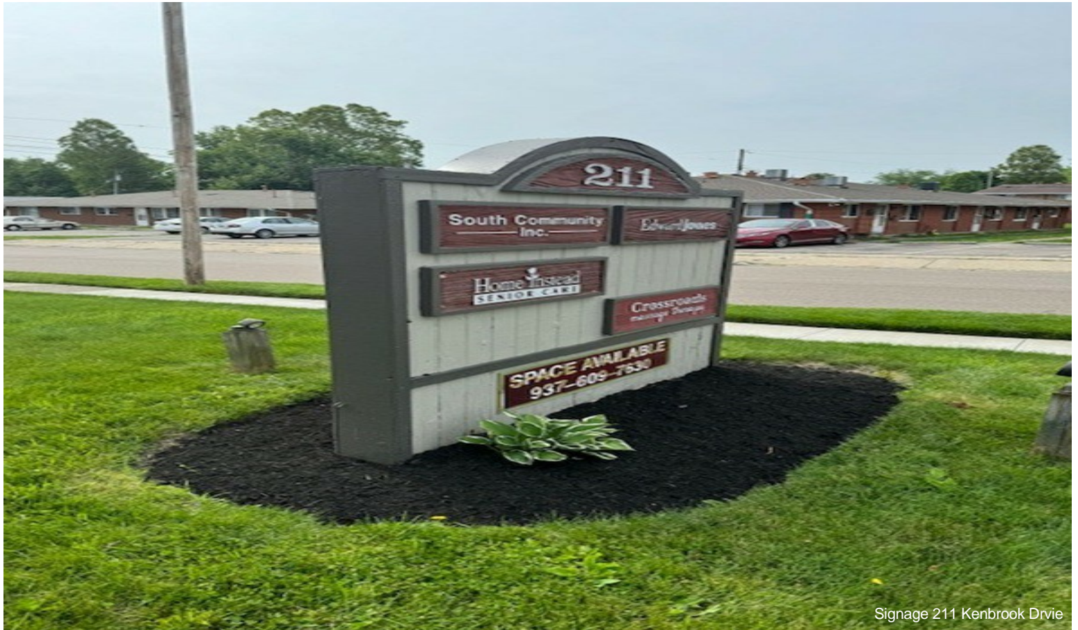
Signage 211 Kenbrook Drive