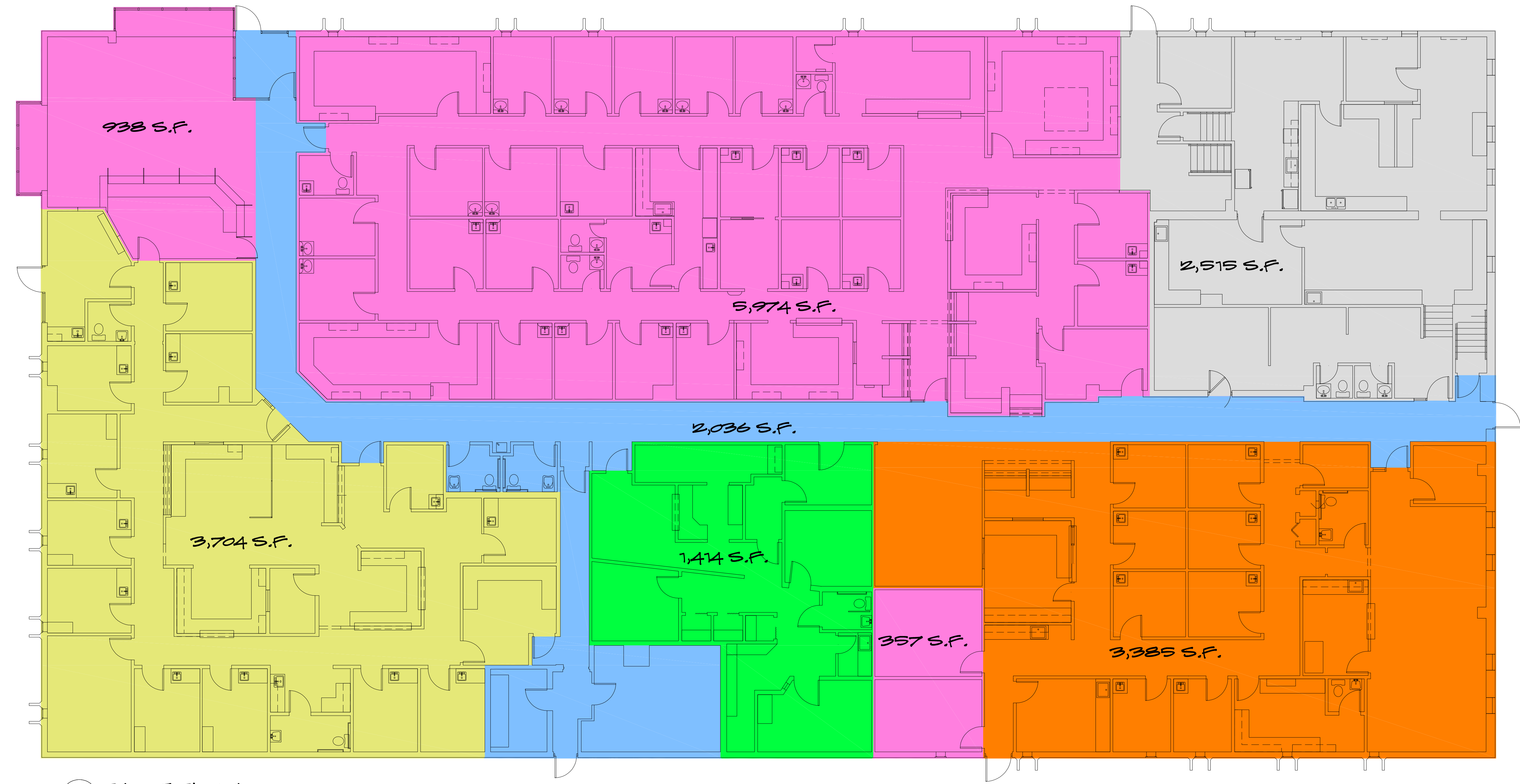
2 FIRST FLOOR 1/8"=1'-0"