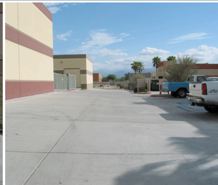
Large Truck Access