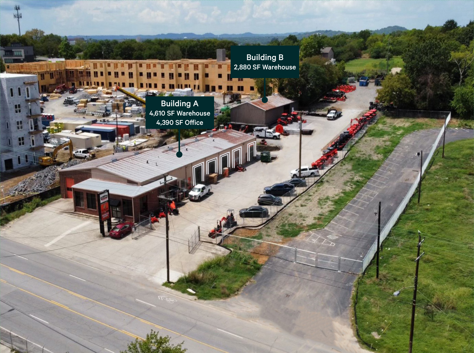
Building B 2,880 SF Warehouse