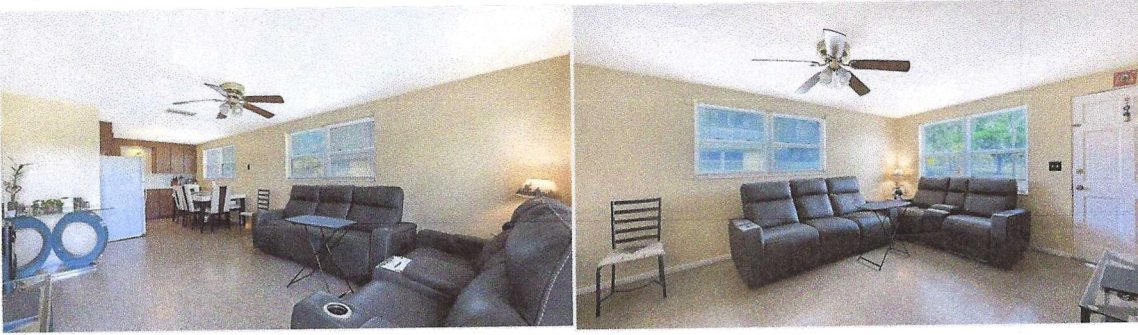
FRONT UNIT has large 15'8" x 12'8" living ro... FRONT UNIT has large 15'8" x 12'8" living ro...