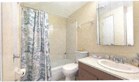
FRONT UNIT bedroom is 10'6" x11' and has a... FRONT UNIT bathroom is 5' x 7'6" and has tu...