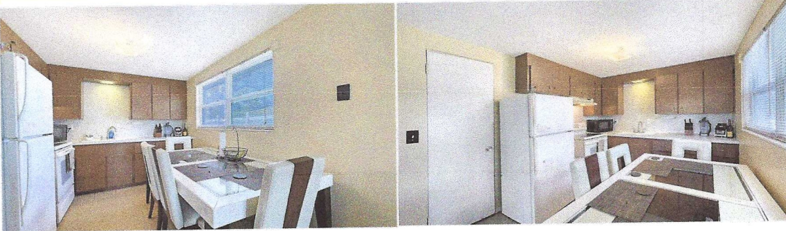
FRONT UNIT has welcoming 11'x 9' eat in kitc...FRONT UNIT has welcoming 11'x 9' eat in kitc...