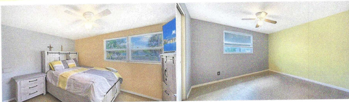
FRONT UNIT HAS large bright bedrooms. Pri... FRONT UNIT bedroom is 10'6" x11' and has a...