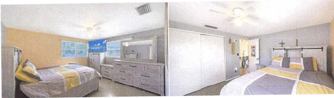
FRONT UNIT HAS large bright bedrooms. Pri... FRONT UNIT HAS large bright bedrooms. Pri...