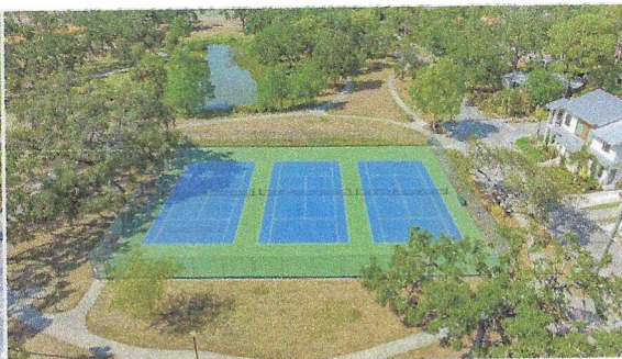
Enjoy an outdoor active lifestyle at Gillespie P...10 acre Gillespie Park has tennis courts whic...