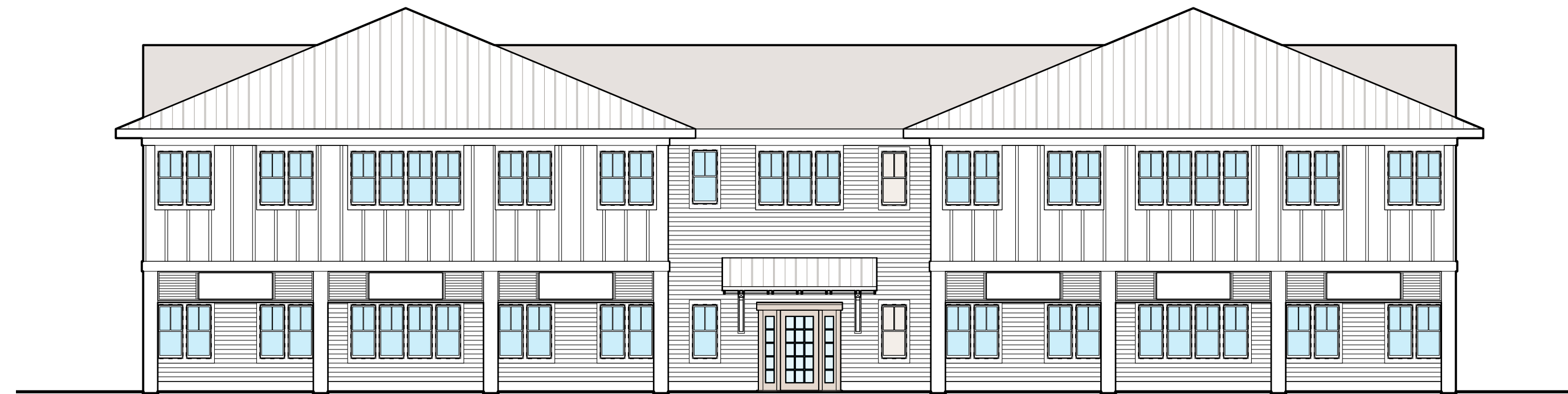
FIRST FLOOR PLAN A1.08 1"=10'