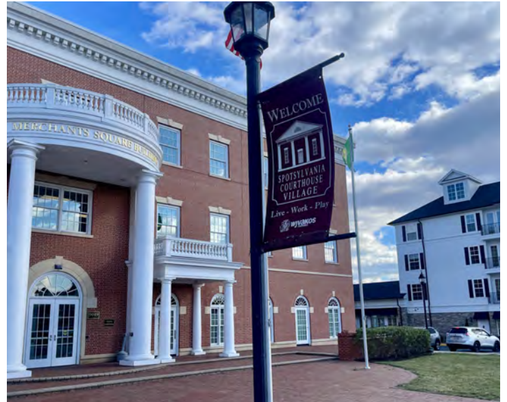
Overlooking Arbor House and Merchant's Square Building, an on-site professional which is owned and fully occupied by Spotsylvania County and roughly 300 daytime workers