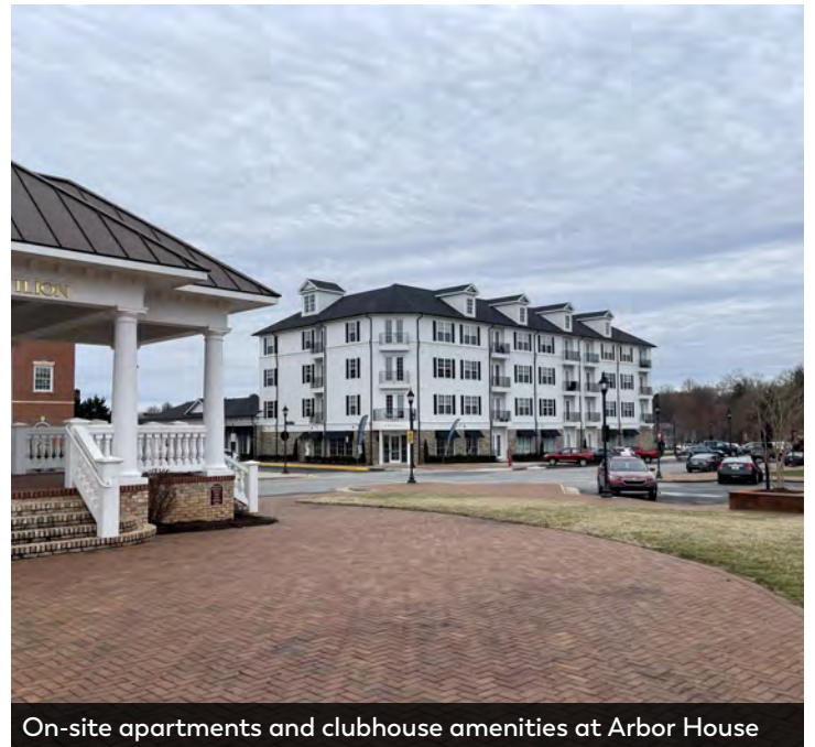
On-site apartments and clubhouse amenities at Arbor House