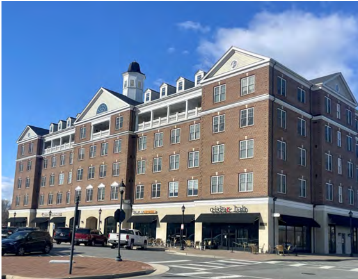
Hanover House includes Anytime Fitness center, All State insurance, Stillwater Aesthetics, and hard-cider tasting room and grill Cider Lab, beneath four (4) stories of luxury apartments with a view of Merchant's Square