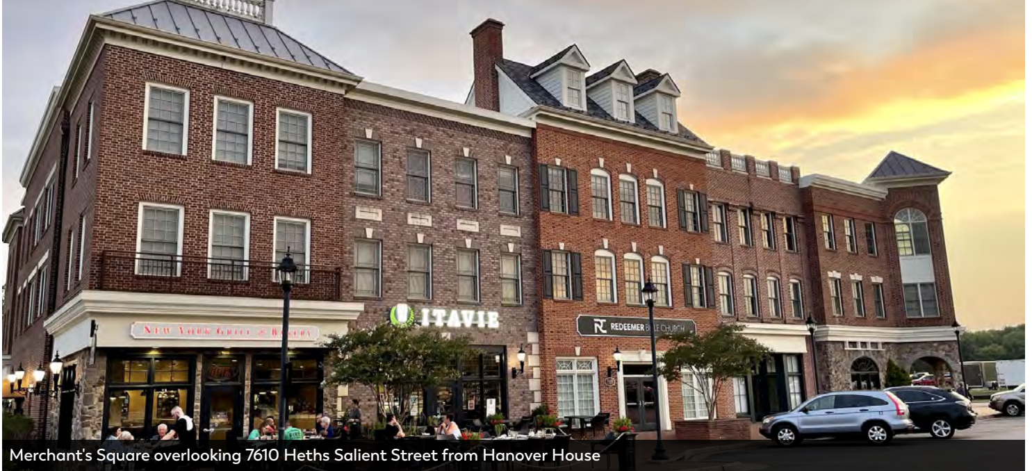
Merchant's Square overlooking 7610 Heths Salient Street from Hanover House