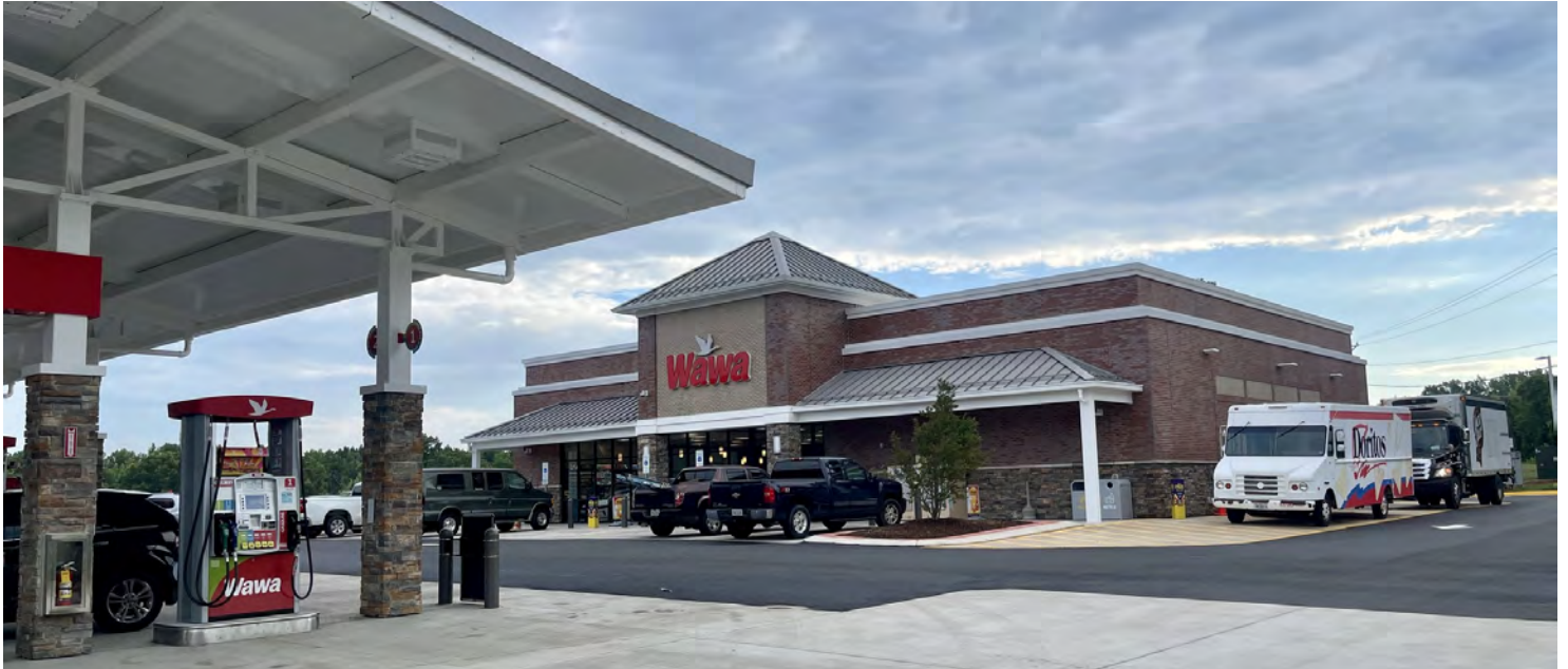
Wawa opened as of June 2023 Delivery on the East end of the Spotsylvania Courthouse Village