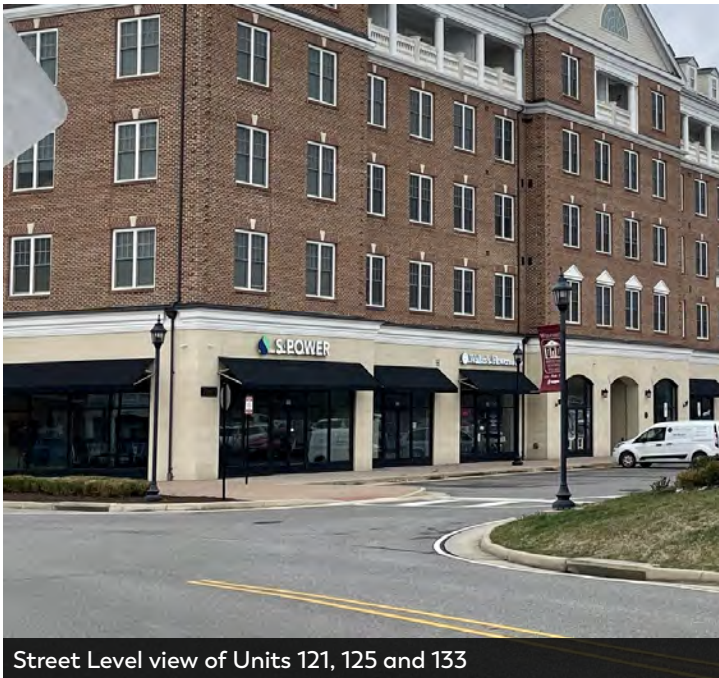
Street Level view of Units 121, 125 and 133