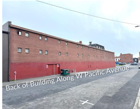
Back of Building Along W Pacific Avenue