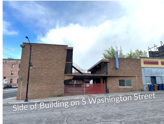
Side of Building on S Washington Street