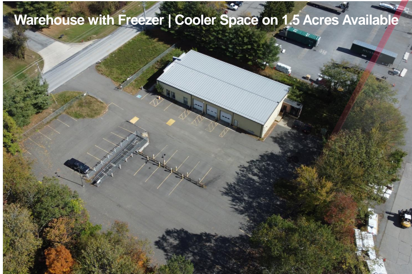
Warehouse with Freezer | Cooler Space on 1.5 Acres Available

Parking: 38+ spots and a fenced-in yard.