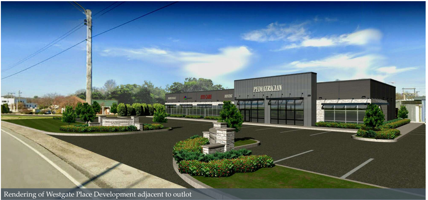
Rendering of Westgate Place Development adjacent to outlot