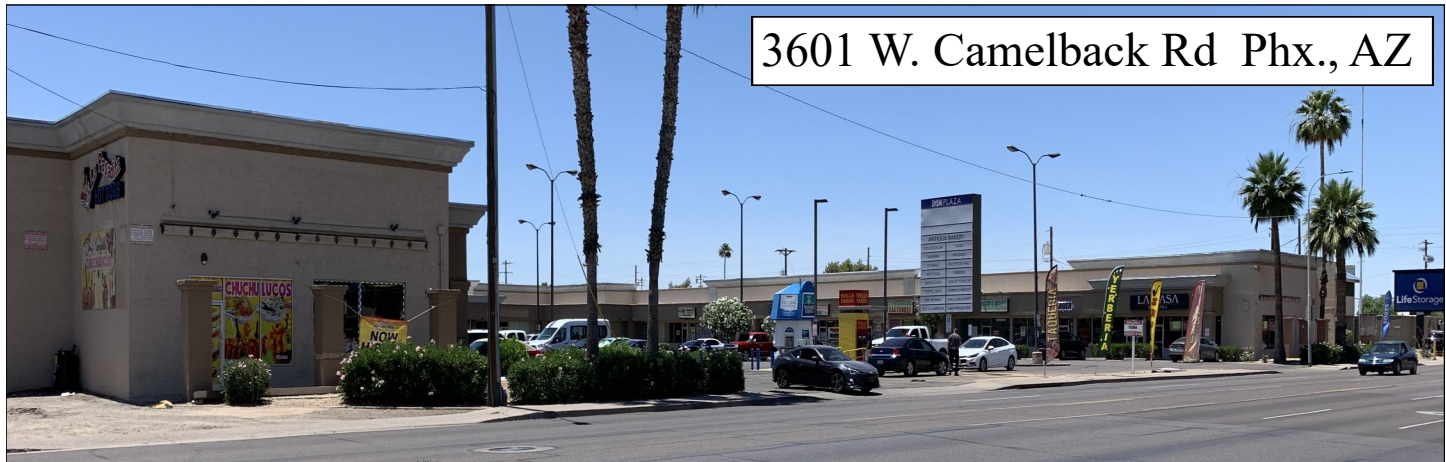
3601 W. Camelback Rd Phx., AZ