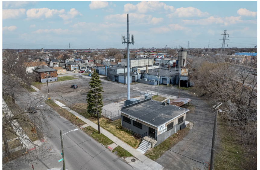
1646 N Green Street. Front of building from Green Street.