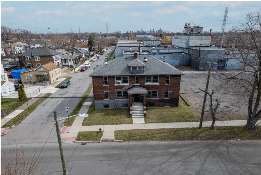
1748 N Green Street. Front of residential building.