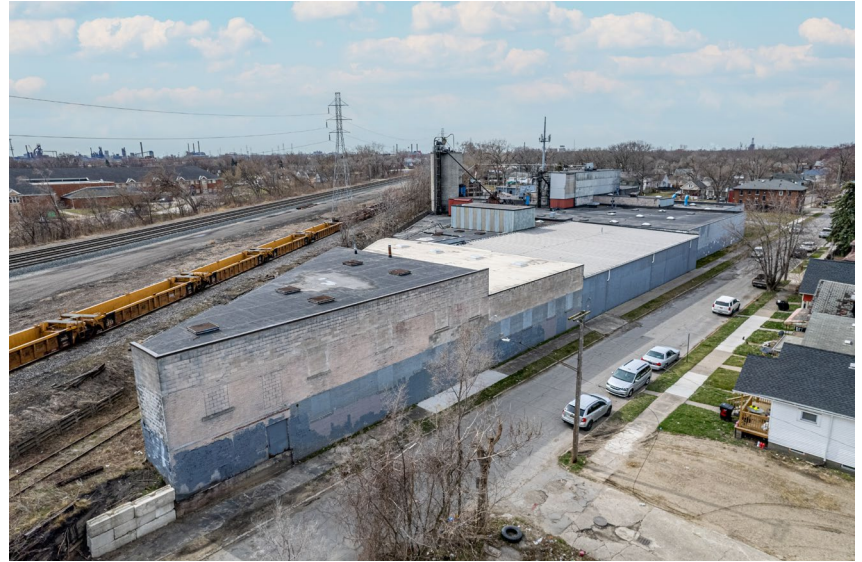
7045 Cahalan Street. Back of building, looking toward Green Street