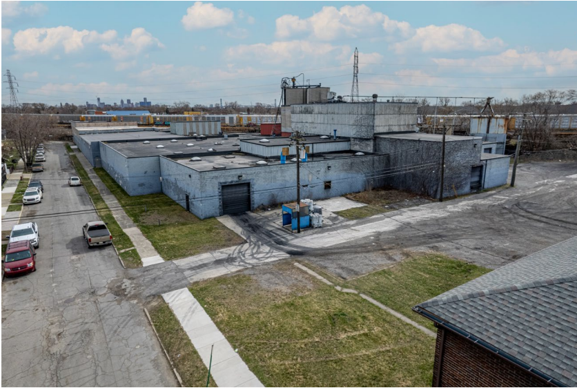
7045 Cahalan Street. Front of building, looking down Cahalan Street