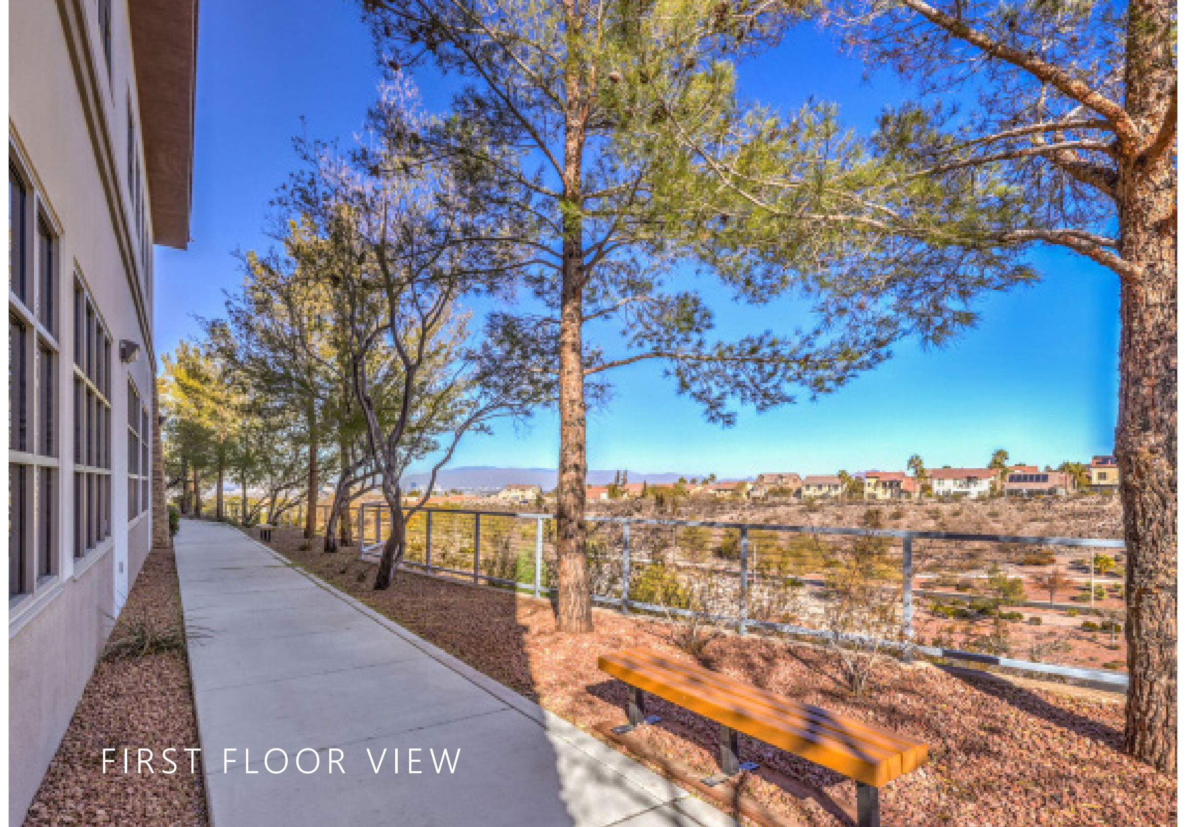
FIRST FLOOR VIEW