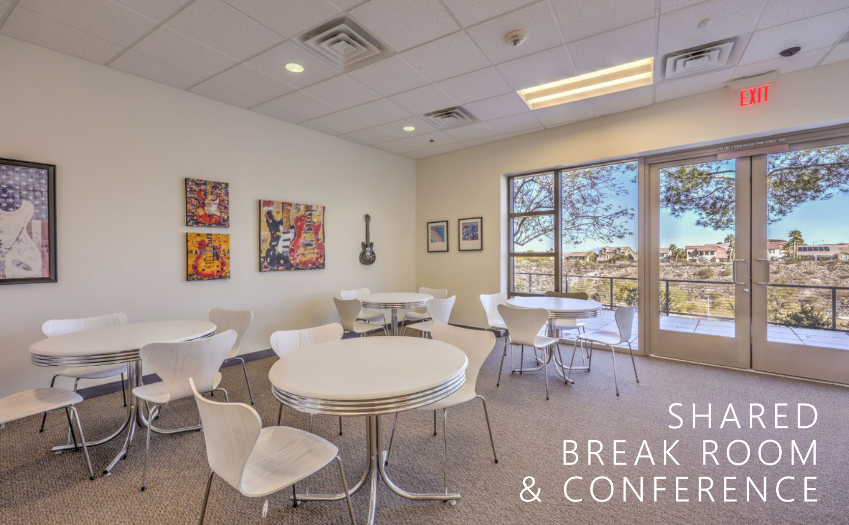
SHARED BREAK ROOM & CONFERENCE