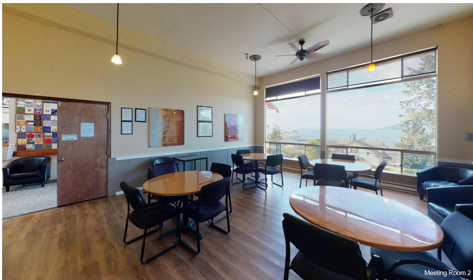
Meeting Room 2