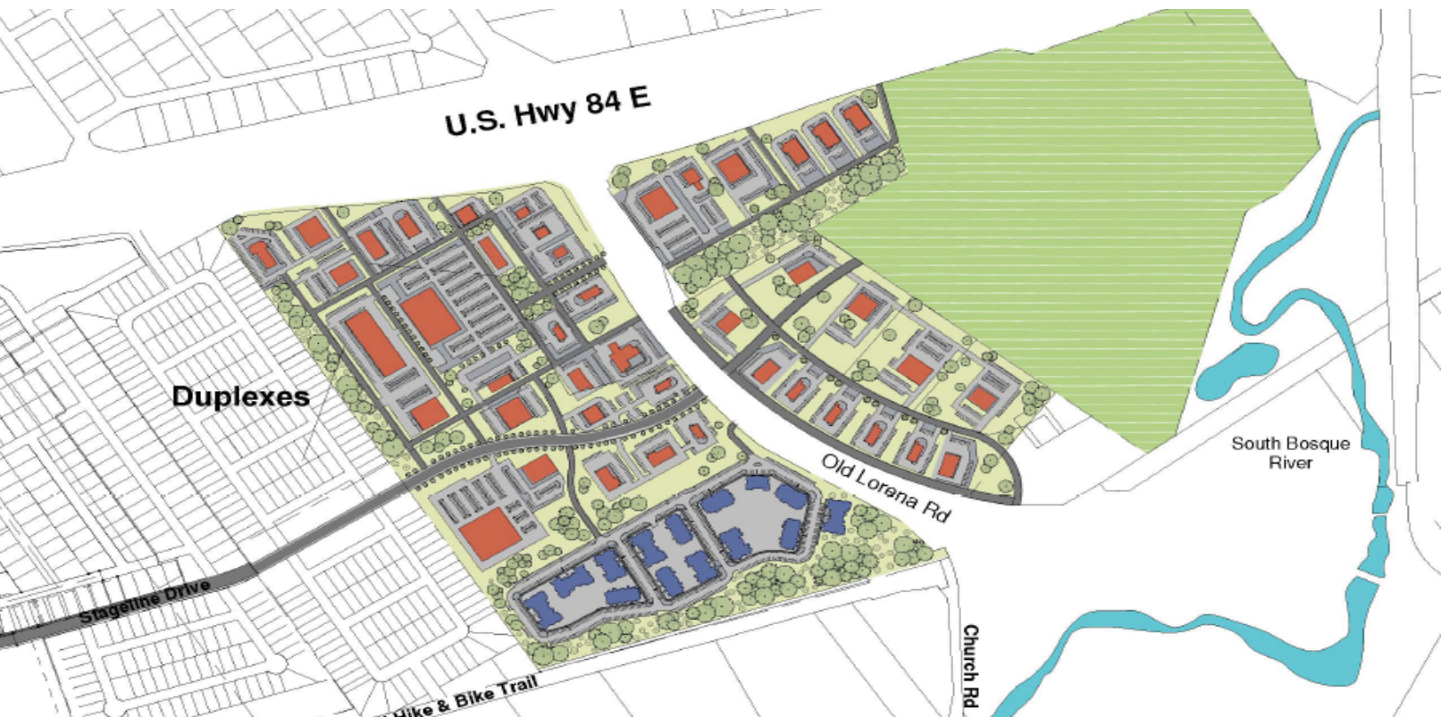
Add text here...