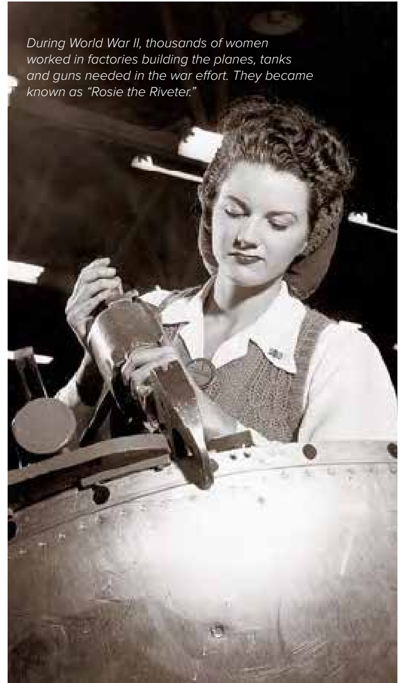
During World War II, thousands of women worked in factories building the planes, tanks and guns needed in the war effort. They became known as "Rosie the Riveter."