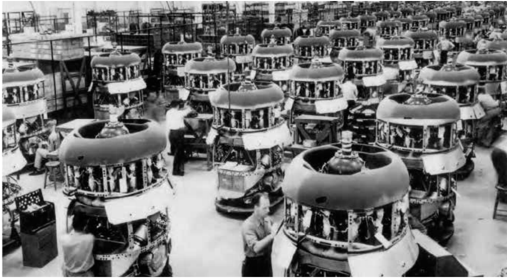
Operating around-the-clock, assembly lines at Rohr in the 1940s built airplane engine components. This assembly line was for the B-24 bomber.