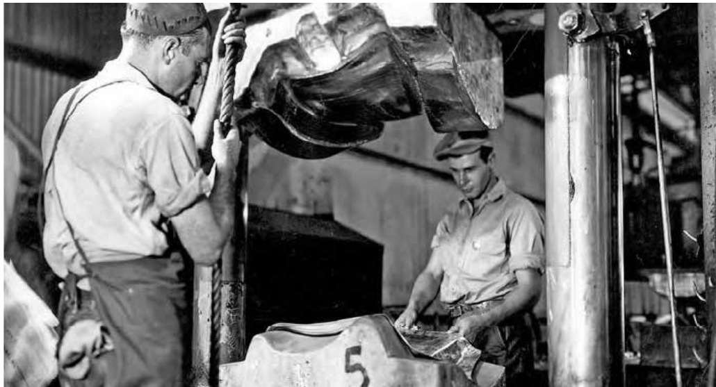
Factory workers used Rohr's "drop hammer" machine to produce thinner and lighter metal for airplanes. The machine had a dramatic effect on the aircraft industry.