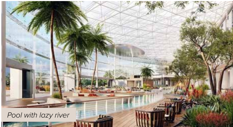
Pool with lazy river