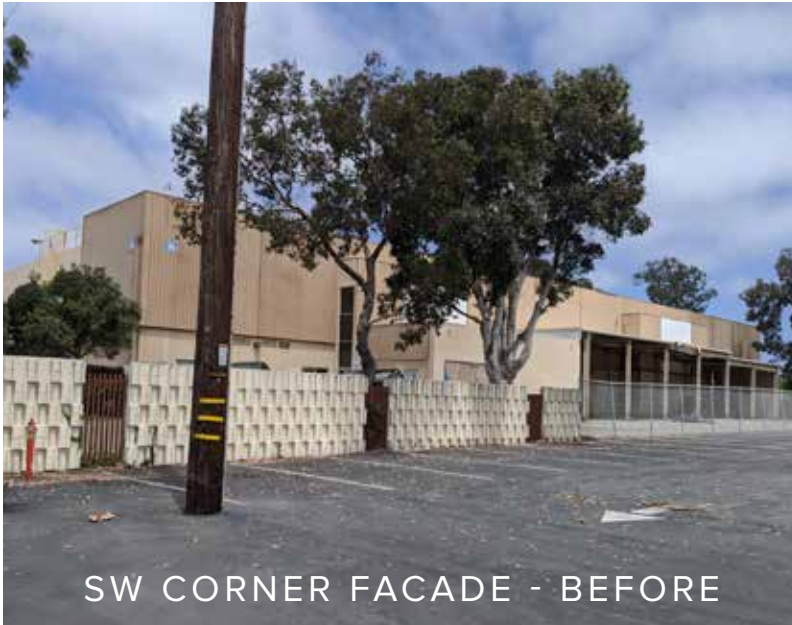
SW CORNER FACADE - BEFORE