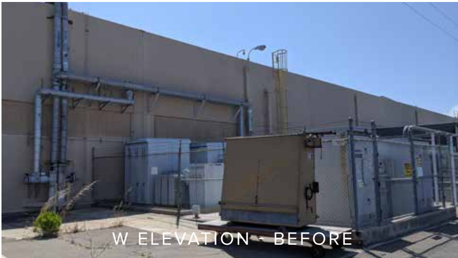
W ELEVATION - BEFORE