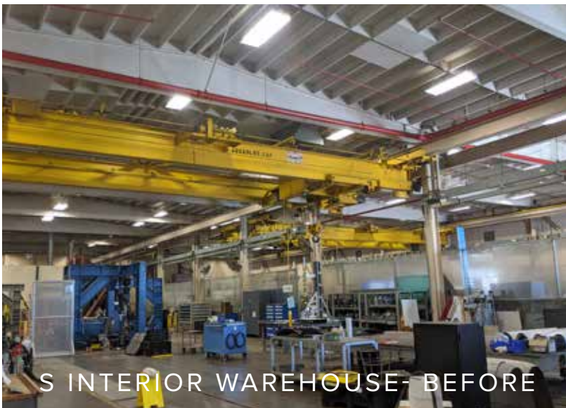
S INTERIOR WAREHOUSE - BEFORE