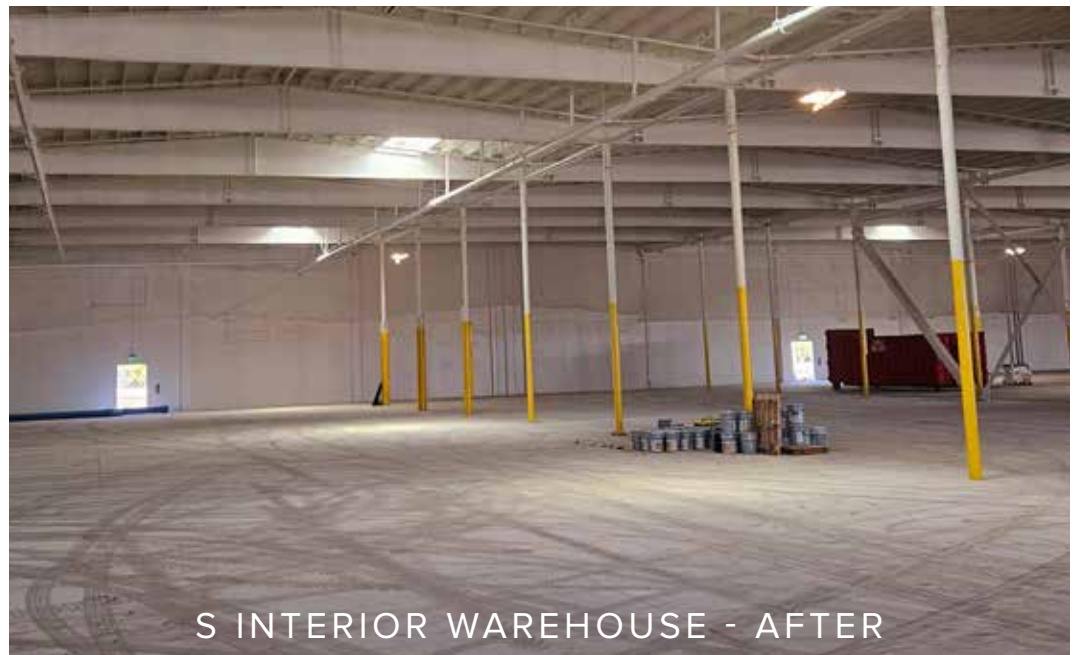
S INTERIOR WAREHOUSE - AFTER