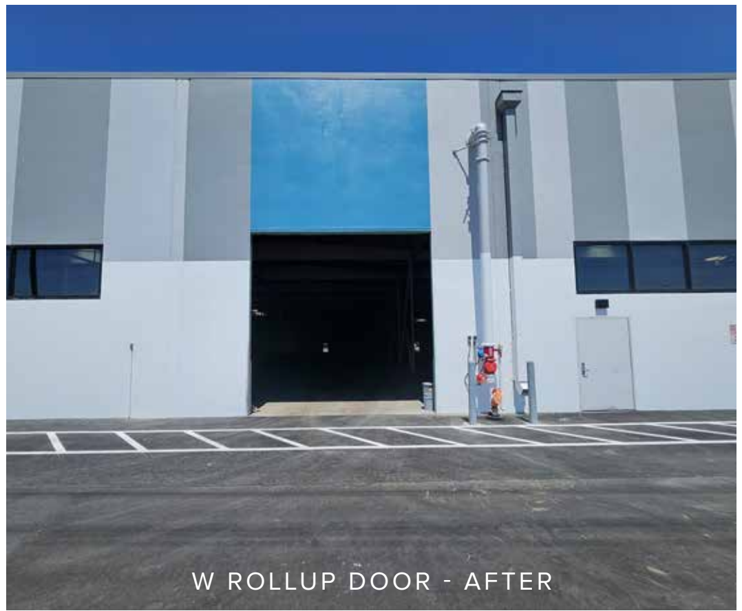
W ROLLUP DOOR - AFTER