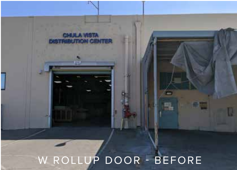
W ROLLUP DOOR - BEFORE