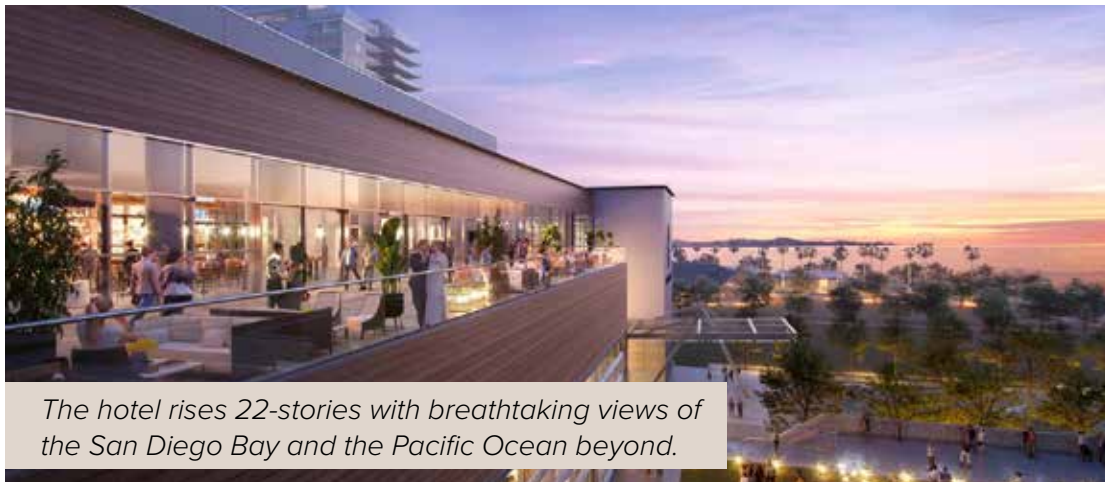
The hotel rises 22-stories with breathtaking views of the San Diego Bay and the Pacific Ocean beyond.