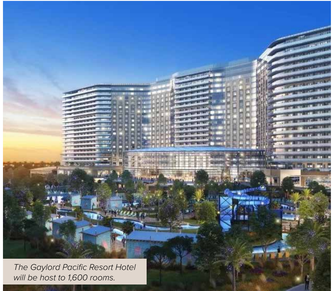
The Gaylord Pacific Resort Hotel will be host to 1,600 rooms.