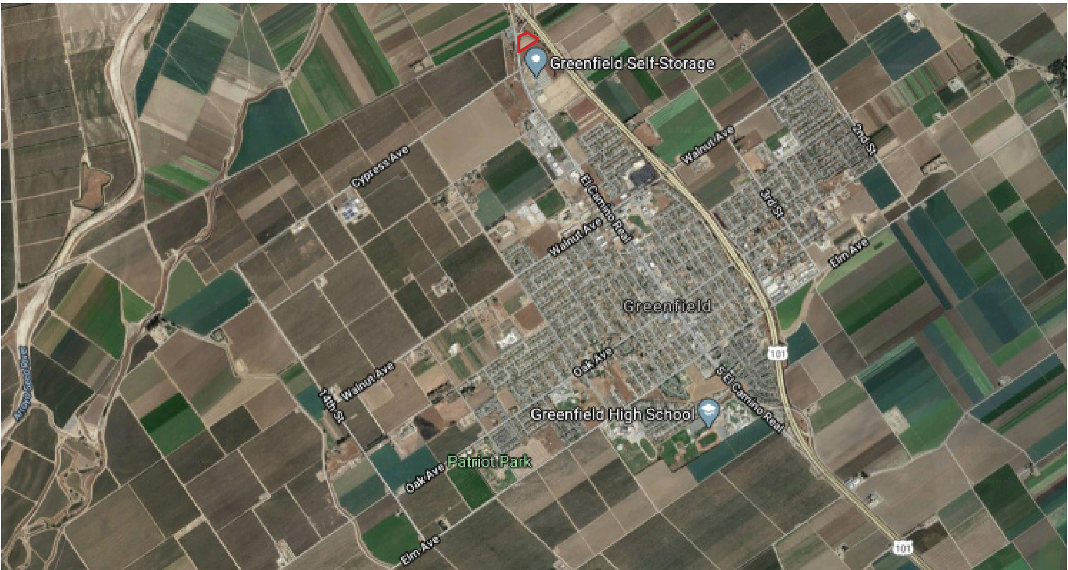
1.73 Acres of Highway Commercial Land on Highway 101 & El Camino Real, Greenfield, CA 93927