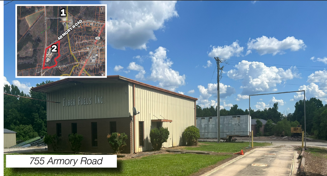
755 Armory Road