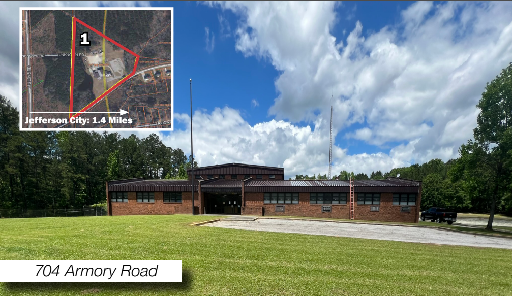
704 Armory Road